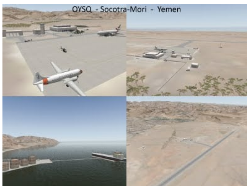
Existing runway and airport

“Among the new programs, Saleh and Petraeus agreed to allow the use of American aircraft, perhaps drones, as well as “seaborne missiles”-as long as the operations have prior approval from the Yemenis, according to a senior Yemeni official who requested anonymity when speaking about sensitive subjects. U.S. officials say the island of Socotra, 200 miles off the Yemeni coast, will be beefed up from a small airstrip [under the jurisdiction of the Yemeni military] to a full base in order to support the larger aid program as well as battle Somali pirates. Petraeus is also trying to provide the Yemeni forces with basic equipment such as up-armored Humvees and possibly more helicopters.” (Newsweek, Newsweek, January 18, 2010, emphasis added)