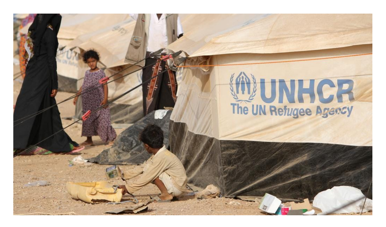
A Yemeni boy in the Markazi refugee camp near Obock, Djibouti

Hundreds of thousands of Yemenis chose to make the perilous journey to leave Yemen to seek safety and asylum in other countries such as Egypt, Djibouti, Somalia, Malaysia, Jordan, and Sudan. These families that were forced out of their beloved homeland by the Saudi-led war find themselves stranded in foreign countries with very little support. The United Nations High Commissioner for Refugees (UNHCR) response to Yemeni refugees' suffering has been completely inadequate and insufficient.