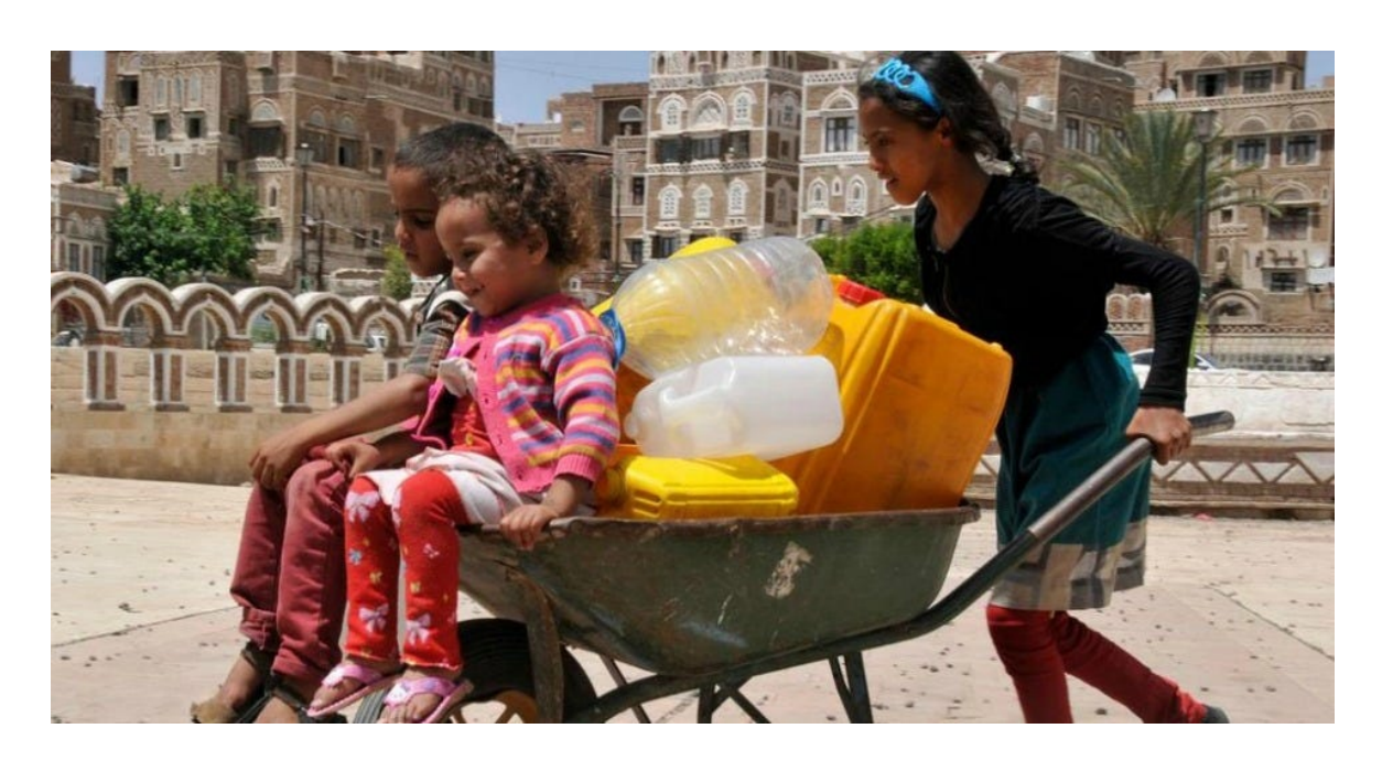
Children collecting water in Yemen's capital Sana'a

The humanitarian crisis in Yemen is the worst in the world. Those who survive the war live in dire situations struggling to provide for their own basic human needs and those of their families. According to the United Nations, nearly 80 percent of the Yemeni population — over 24 million people — rely on humanitarian assistance to live. Children suffer the most, with 100,000 children under five years old at risk of dying from acute malnutrition.