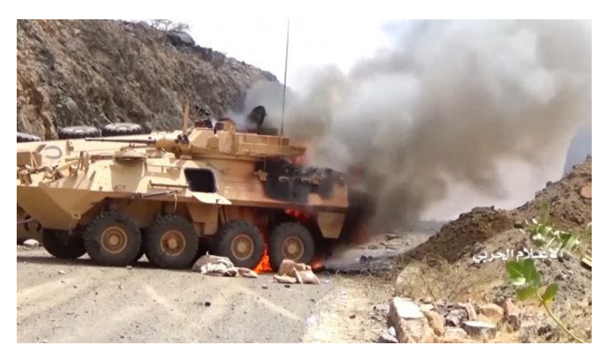
A Canadian-made LAV sold to Saudi Arabia is seen burning after clashes in the Kitaf district in northern Yemen

In addition to profiting from the war, Canada also joins other Western countries in disregarding the Yemeni refugee situation. While hundreds of thousands of Yemenis are still stranded in transit countries, Canada has only accepted <u>124 refugees</u> from Yemen between January to June 2020. What a shame!