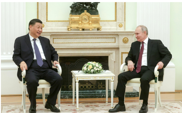
Image: With President of the People’s Republic of China Xi Jinping.

Russia lost the members of the Warsaw Pact; its economy was down; the leaders under Boris Yeltsin were corrupt; and Russia’s international influence was almost wiped out.