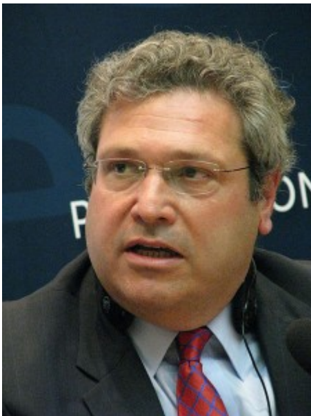
Image: Prominent neocon intellectual Robert Kagan.

So, Clinton’s election could mean that some of the most dangerous people in American foreign policy would be whispering their schemes for war and more war directly into her ear – and her record shows that she is very susceptible to such guidance.