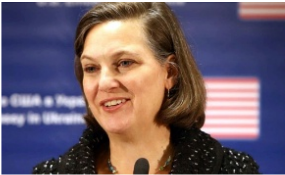
Image: Assistant Secretary of State for European and Eurasian Affairs Victoria Nuland during a press conference at the U.S. Embassy in Kiev, Ukraine, on Feb. 7, 2014.

The behind-the-scenes neocon influence became especially pronounced at Clinton's State Department where she tapped the likes of Nuland, a neocon ideologue and an adviser to Vice President Dick Cheney, to become the department's spokesperson and put her on track to become Assistant Secretary of State for European Affairs (although the appointment wasn't finalized until after Clinton left in 2013).