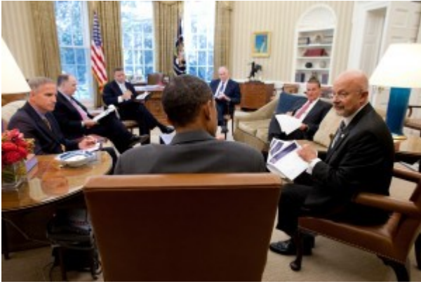
Image: Director of National Intelligence James Clapper (right) talks with President Barack Obama in the Oval Office, with John Brennan and other national security aides present.

Obama also got help from Russian President Vladimir Putin who persuaded President Assad to surrender all his chemical weapons (while Assad still denied any role in the sarin-gas attack). Putin's assistance infuriated the neocons who soon recognized that the Obama-Putin cooperation was a profound threat to their "regime change" enterprise.