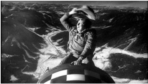
Image: A scene from "Dr. Strangelove," in which the bomber pilot (played by actor Slim Pickens) rides a nuclear bomb to its target in the Soviet Union.

for massing more and more U.S. troops and NATO weapons systems on Russia's border to deter Putin's "aggression."