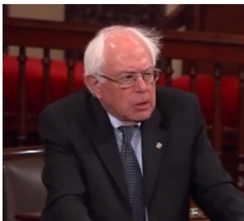
Image: Sen. Bernie Sanders of Vermont, who is seeking the Democratic presidential nomination.

Sanders, the 74-year-old “democratic socialist” from Vermont, draws huge and excited crowds and wins younger voters by staggering percentages. Meanwhile, Clinton confronts polls showing high negatives and extraordinary public distrust.