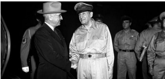
Image: Truman and MacArthur, 1950

The criminal bombings of Pyongyang in 1951 ordered by president Truman, had been opposed by General Douglas MacArthur who was commander of allied forces in Korea: