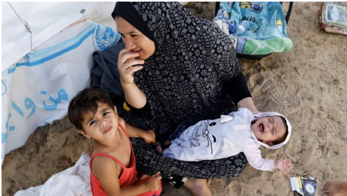
A woman and her children, who fled their homes amid Israeli air strikes, take shelter at a tent camp at a United Nations-run centre in Khan Younis in the southern Gaza Strip on Monday.