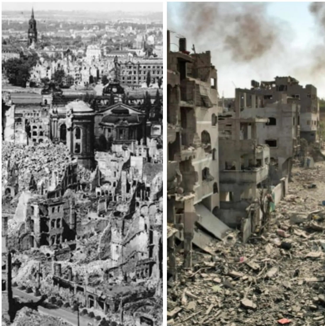
Dresden versus Gaza

In recent developments Israeli officials have justified its killing of civilians in Gaza by pointing to the bombing of the German city of Dresden (a civilian target) as well as many other German cities by the U.S. and Britain towards the end of World War II.