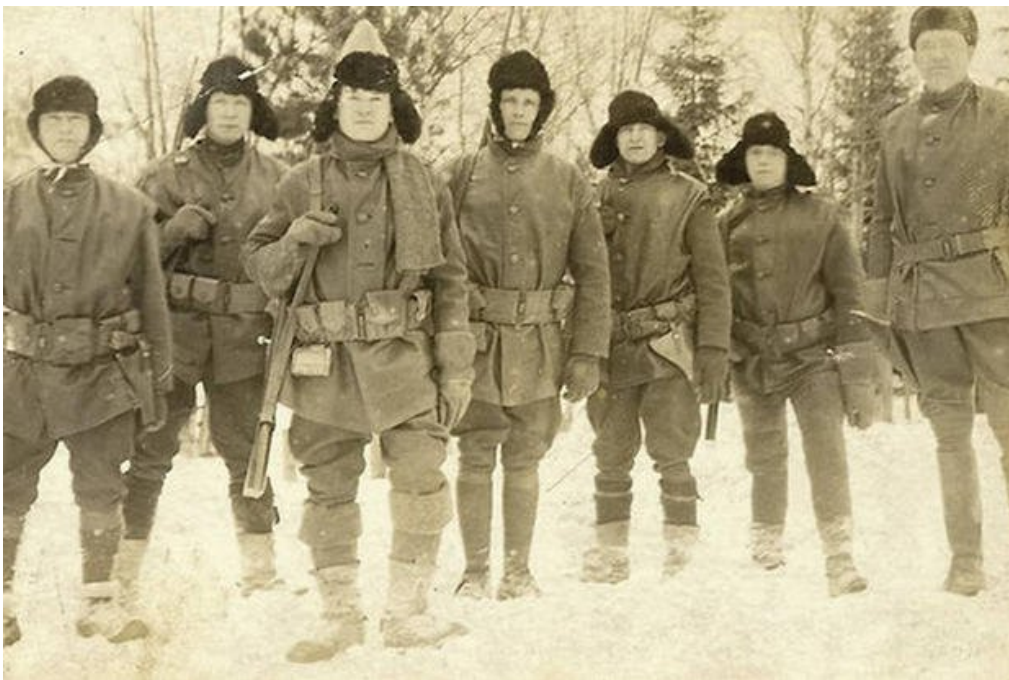
U.S. soldiers in Siberia in 1918 in an ill-fated invasion designed to overthrow the Bolshevik revolution.

Toward the end of WW I, U.S. President Woodrow Wilson joined with Britain, France and Japan to launch a military invasion of Russia that included 8,500 American soldiers. It was originally intended to block the German war effort, but after the 1917 Russian Revolution, the Allied forces stayed on until 1920 in a futile attempt to overthrow Russia’s Bolshevik government.