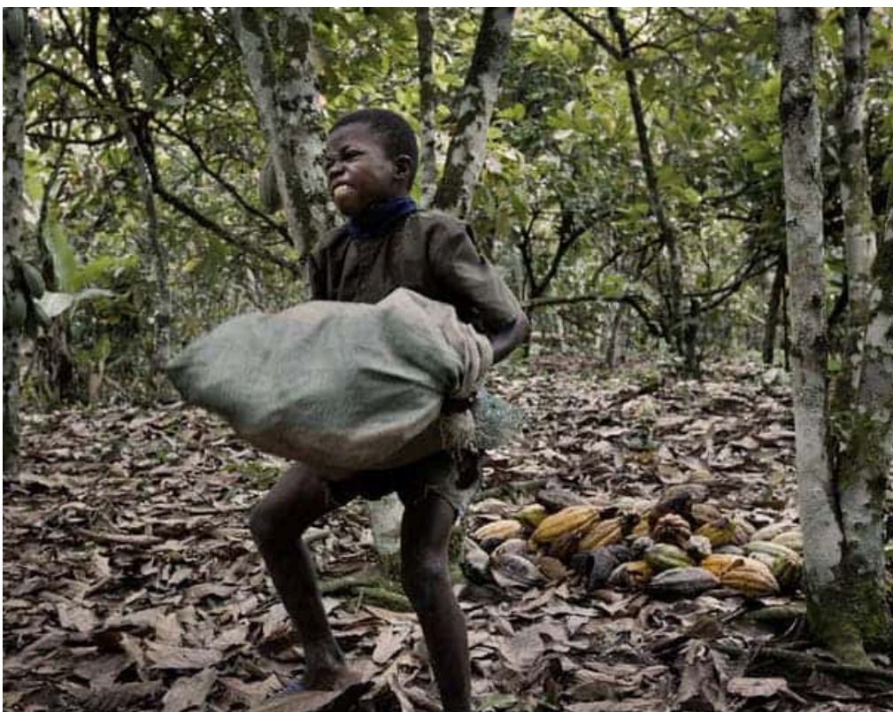
Children labor was found in Nestle's supply chain.

Most people love chocolate , but few know the dirty deals behind chocolate production. The 2010 documentary The Dark Side of Chocolate brought attention to purchases of cocoa beans from Ivorian plantations that use child slave labour. The children are usually 12 to 15 years old, and some are trafficked from nearby countries – and Nestle is no stranger to this practice.