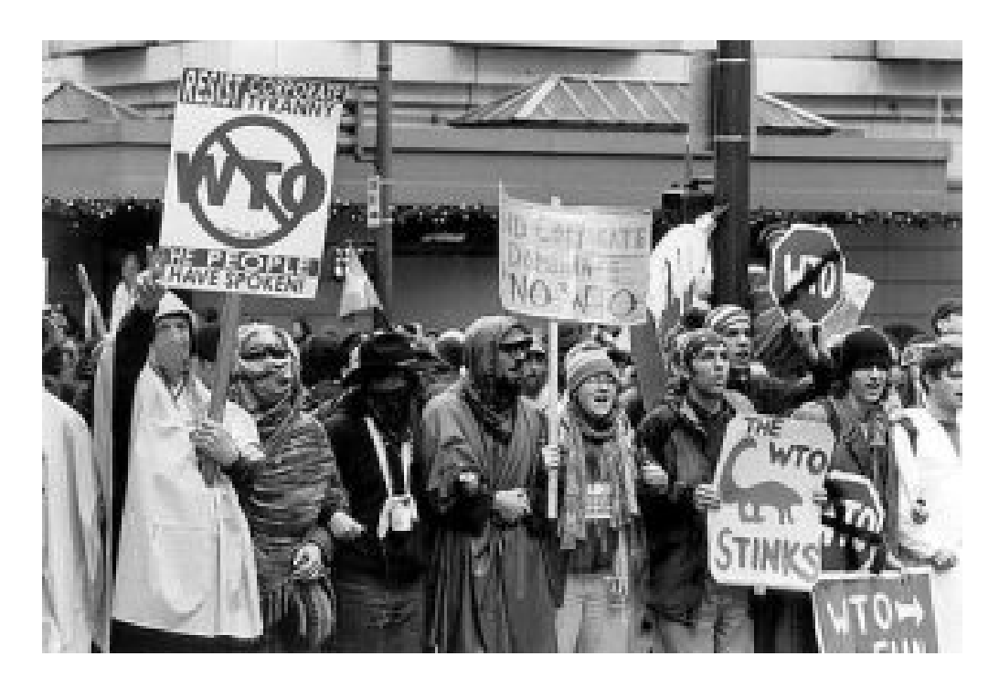
Then (1999): the "Black Bloc" in '99, fighting a class war that may have legitimately challenged the multinational corporate state (embodied by the WTO) if it had fostered popular support.