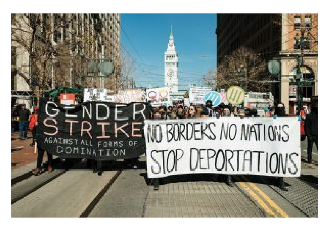
#2: The True Anti-Authoritarian, Anti-Establishment Left in America Is Dead

The corporate state certainly would target the Left if it posed a threat to its interests -- except that there is no authentic anti-authoritarian Left still alive in the United States.