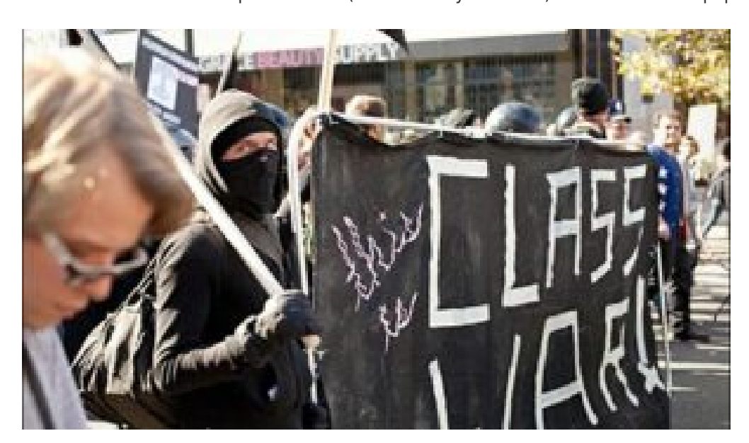
Now (2021): "Antifa" earlier this year showed up to fight the culture war outside of an LA spa where a "transgender woman" flashed her semi-erect penis at a mother and child in the women's-only section. The "transgender" perpetrator was later charged by the LAPD over the incident and exposed as a convicted sex offender for previous indecent exposure crimes.

The victim (the mother) had the audacity to make a social media video about the trauma imposed on her daughter, which led to a <u>"trans rights" protest</u> against alleged rampant transphobia (in LA, one of the most "progressive" cities in America).