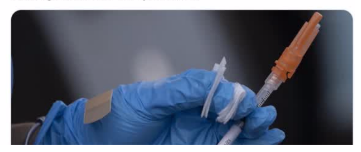
Click here to watch the video.

They're fast rolling out 10 million vaccines for U.S toddlers. There is NO science to support this. NONE. Parents, protect your babies from this Pharma campaign. I am begging you. I don't want more patients, am drowning in the care of vax-injured as it is.