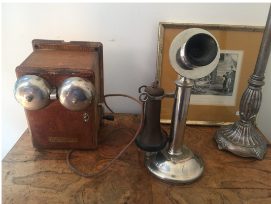
1920s telephone, private collection.

Below are excerpts from Tesla's historic 1926 interview (emphasis added)