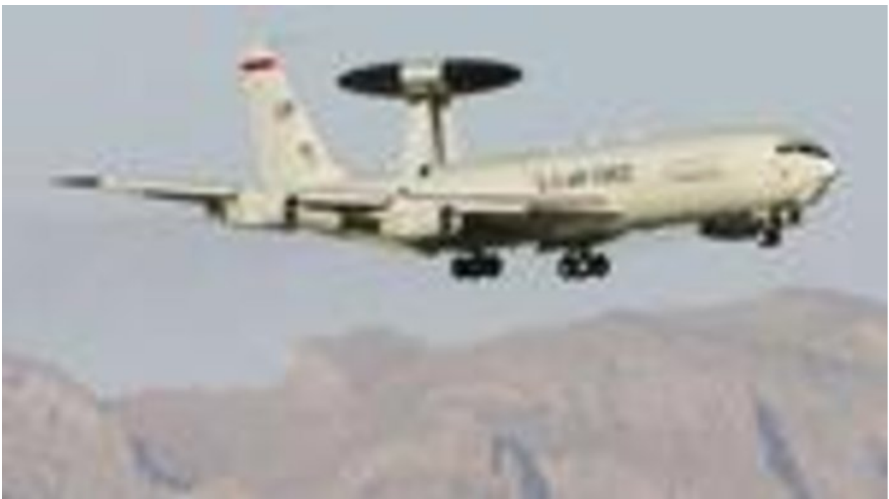
US Awacs monitor Libya

Officially, Nato will only describe the presence of American Awacs planes as part of its post-9/11 Operation Active Endeavour, which has broad reach to undertake aerial counter-terrorism measures in the Middle East region.