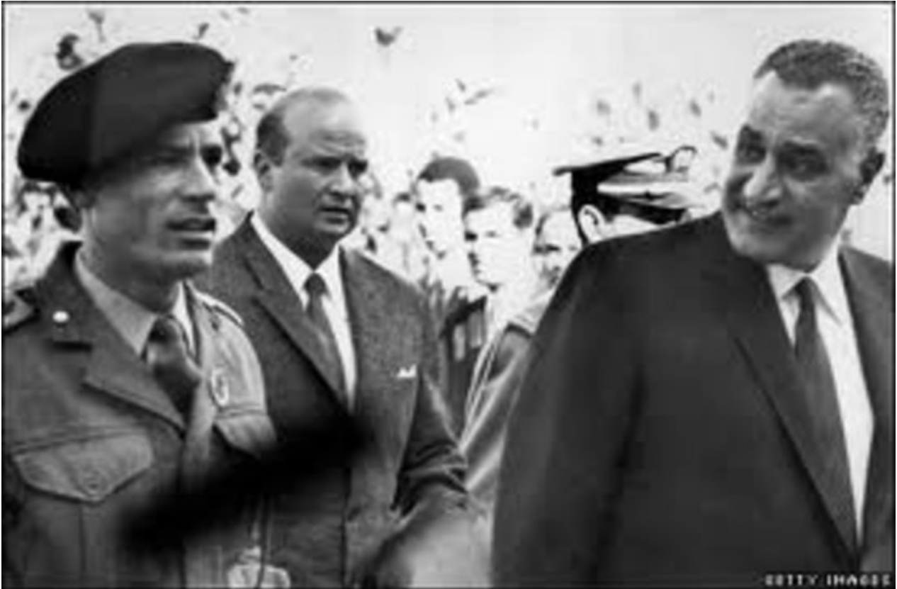
Gaddafi and Nasser in a 1969 Photo.