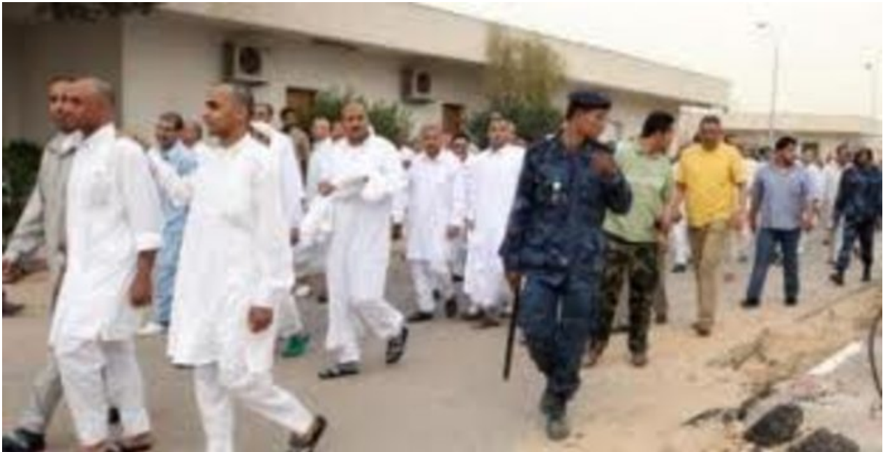
Libyan Islamic Fighting Group Members released

counter-terrorist experts have expressed concern that al-Qaida could take advantage of a political vacuum if Gaddafi is overthrown. But most analysts say that, although the Islamists' ideology has strong resonance in eastern Libya, there is no sign that the protests are going to be hijacked by them. 10