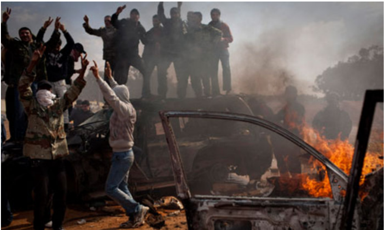
Anti-Gadhafi fighters in Benghazi

Qatari flags fly prominently in rebel-held Benghazi. After pro-Gadhafi forces retook the town of Ras Lanuf last week, Libyan state TV broadcast images of food-aid packages bearing the Qatari flag.