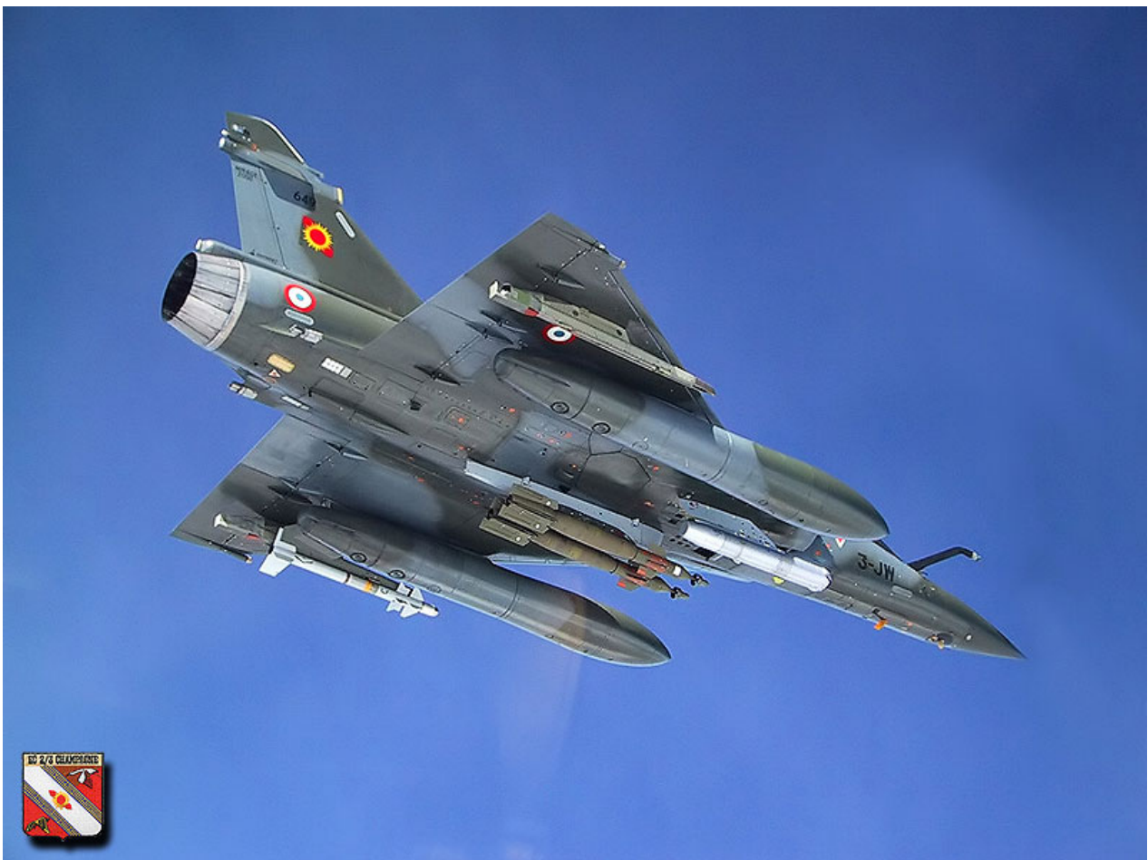
France’s Mirage 2000 used in Operation Odyssey Dawn against Libya, slated to be used in the Southern Mistral war games against “Southland”.

The French Air Force announced (in English) the “Suspension of exercise Southern Mistral 2011 [against SOUTHLAND]... Due to the current international events [BOMBING OF LIBYA], exercise Southern Mistral has been suspended.” Suspension of exercise Southern Mistral 2011 . The French version uses the term Mise en veille which means “put on standby” ( Mise en veille de l'exercice Southern Mistral 2011 ). THE OPERATION WAS NOT “PUT ON STANDBY”: THE BRITISH AND FRENCH WAR PLANES WHICH WERE TO BE DEPLOYED AS PART OF OPERATION “SOUTHERN MISTRAL” INCLUDING FRANCE’S MIRAGE 2000 AND BRITAIN’S TORNADO GR4A WERE SENT TO BOMB LIBYA.