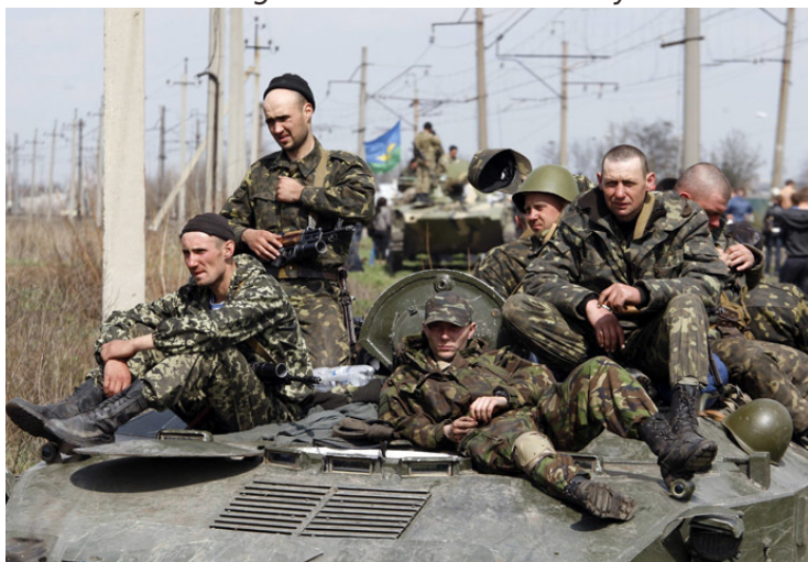
Image: These Ukrainian soldiers had enough, source

Refuse to fight and reclaim your birthright of living in peace.