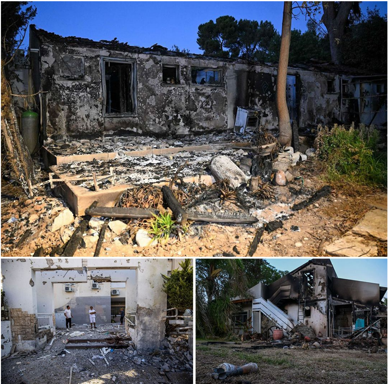
Aftermath of Be'eri Kibbutz after the fire power of the two sides ceased