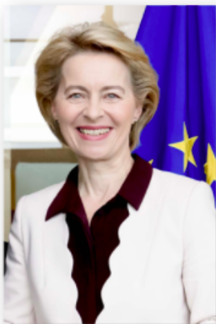
Ursula von der Leyen President of the European Commission since December 1, 2019

Many people have asked if I attend DAVOS meetings. The answer is NO! I considered taking a booth there to display Socrates, but decided against it because the overall theme of Davos was the very opposite of my personal views and the forecast of Socrates which says they will crash and burn.