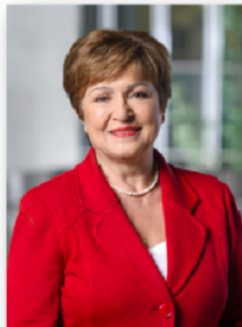
Kristalina Georgieva-Kinova Chair & Managing Director of the International Monetary Fund since October 1, 2019

The World Economic Forum is really a major effort to control the world.