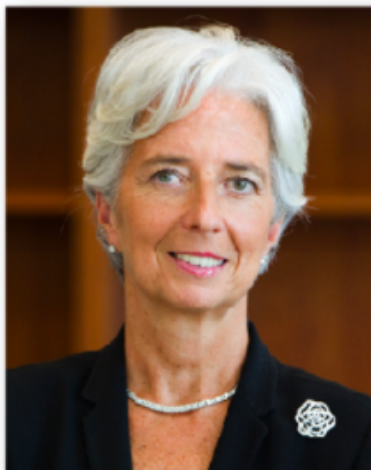
Christine Lagarde President of the European Central Bank since November 1, 2019