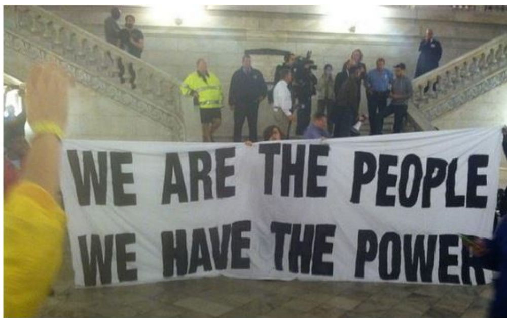
People have the power; protest in Ferguson City Hall in 2014.

The movement must be clear about which side we are on, the people's side, put forward a vision of a future that draws the masses — including members of the power structure — and be organized to fight for our vision.