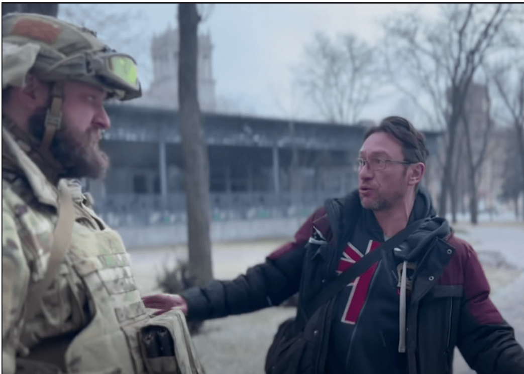
Azov soldier (L) appears on March 11 with a local man outside the Mariupol theater

Since Russia launched its invasion, Azov Battalion soldiers have been filmed preventing civilians from leaving Mariupol – even forcing men out of their cars and brutally assaulting them while they attempted to break through the paramilitary’s checkpoints. If testimony from many Mariupol residents was to be believed, Azov had used many of them as human shields.