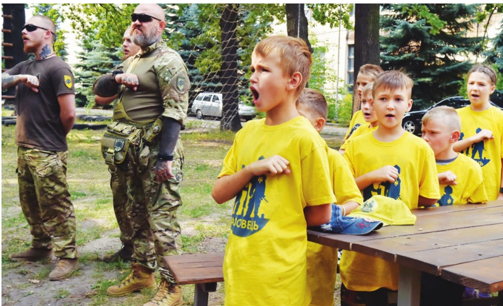
Children undergo military training at a summer camp run by the Azov Battalion in 2015

But Kiev’s most emotionally potent allegation so far – that Russia deliberately bombed innocent children cowering inside a theater – has been undercut by testimonies from Mariupol residents and a widely viewed Telegram message explicitly foreshadowing a false flag attack on the building.