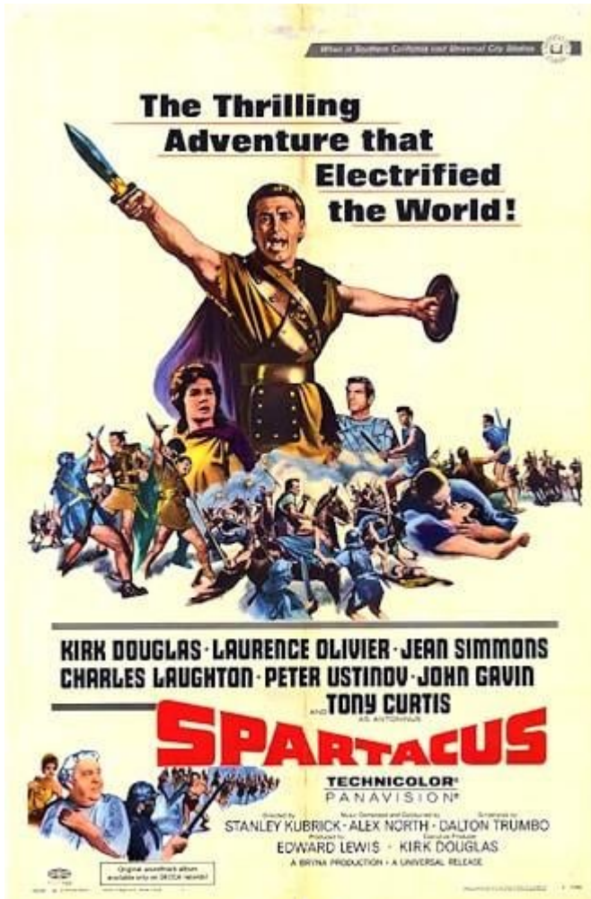
Poster for the film Spartacus (1960) directed by Stanley Kubrick.

The idea of using cinema to promote social change has been around for a long time. The social realism in the films of Frank Capra, or the cinema of the Italian Neo-Realists tend to represent the reality of poverty, but not necessarily the kind of social consciousness needed to question the hierarchy. In other words, they reflect the system but do not change it.