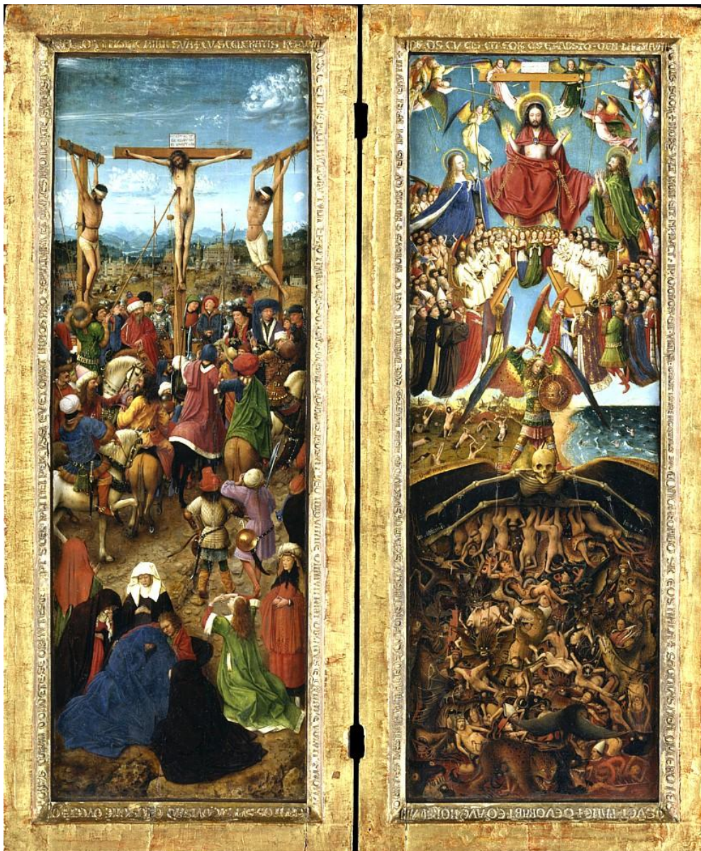
Christ as Martyr and Master Crucifixion and Last Judgement diptych , c. 1430–1440 by Jan van Eyck (1390–1441)

To refer back to the human predicament of slavery (in its different forms) I am using the same metaphor from my previous articles [see Origins of Violence and Resistance Culture ] based on Jan van Eyck's (c. 1390 – 1441) painting, Crucifixion and Last Judgement diptych (c. 1430–1440) where we see Christ as 'Martyr' and 'Master':