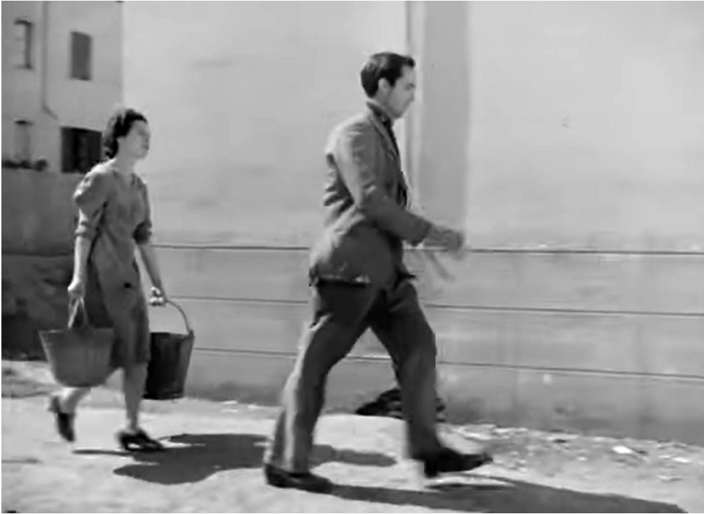
Bicycle Thieves (Italian: Ladri di biciclette ) (1948) Italian neorealist drama film directed by Vittorio De Sica.

If a 'domestic' ever becomes active, he/she switches over to become a 'warrior' protagonist. Over time the 'warriors' expanded to include different ethnicities and sexualities. The 'warriors' are often alienated from the 'domestics' as they are often shown in cinema as a loner, undomesticated, and/or a whisky drinking hero.