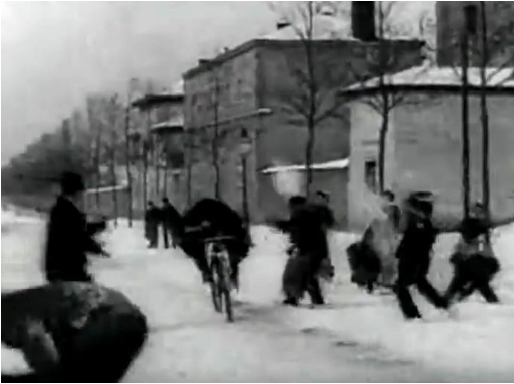
Bataille de boules de neige (Snow Fight) (1896) short silent film produced by the Lumière brothers. (See video here )