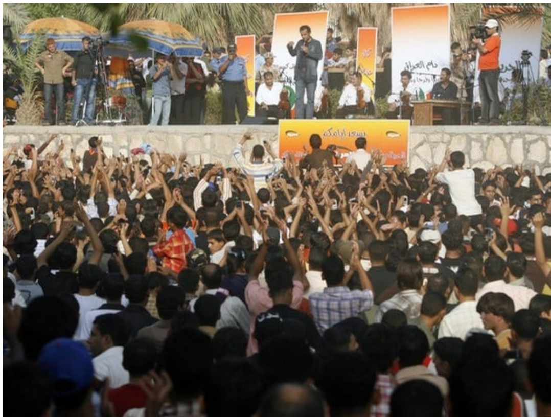
Iraqi youth attend a concert in Al-Zawra amusement park during Eid al-Fitr, a national holiday to celebrate the end of the Muslim holy month of Ramadan, in Baghdad October 14, 2007.