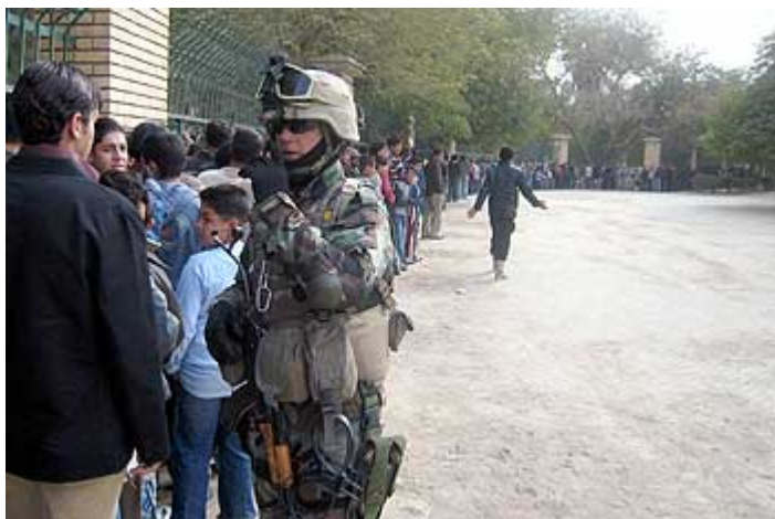
An Iraqi soldier talks to youths as they queue outside al-Zawra park in central Baghdad during the Eid al-Adha festivities in December 2007.