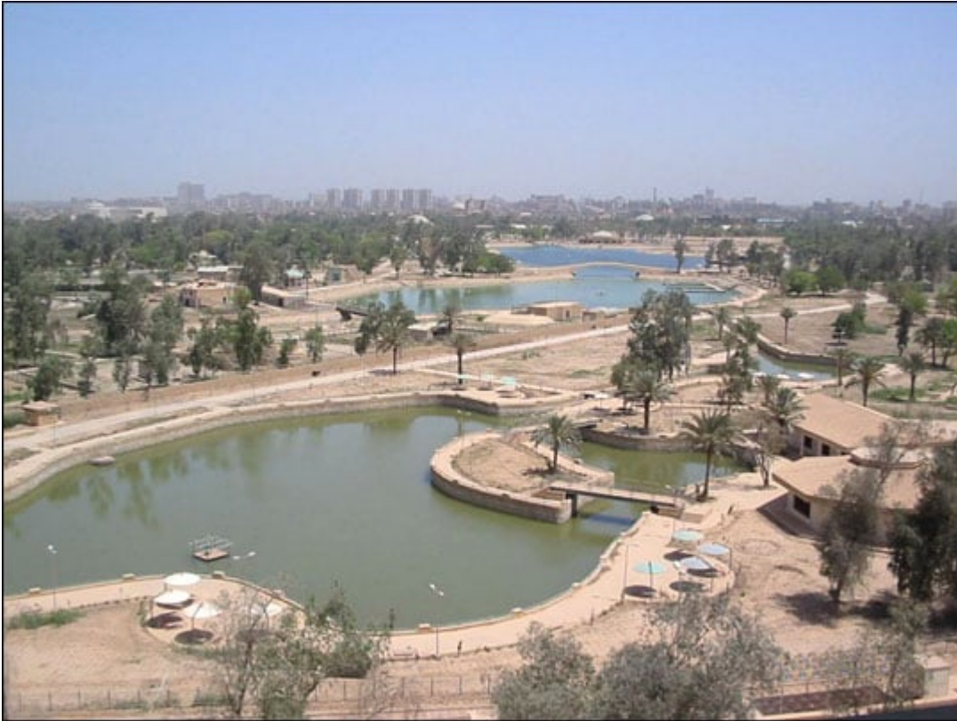
Al Zawra park

Also in April 2003, Iraq's archeological treasures were looted with the support of the American invaders. The pillaging of Iraq's cultural heritage was a premeditated act. The looters were protected by the invaders.