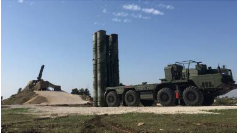
Russia S-400 deployed in Syria

While the broader public was led to believe that a major confrontation between Russia and the US-led coalition was imminent, with potentially devastating consequences, a handful of officials in the upper echelons of the US, UK and French governments were privy to the precise details and timing of the bombing operation against Syria which took place after the closing of the World's stock markets on Friday evening, April 13 (ET). They had advanced knowledge that a confrontation between Russia and the US-led Coalition forces would not take place.