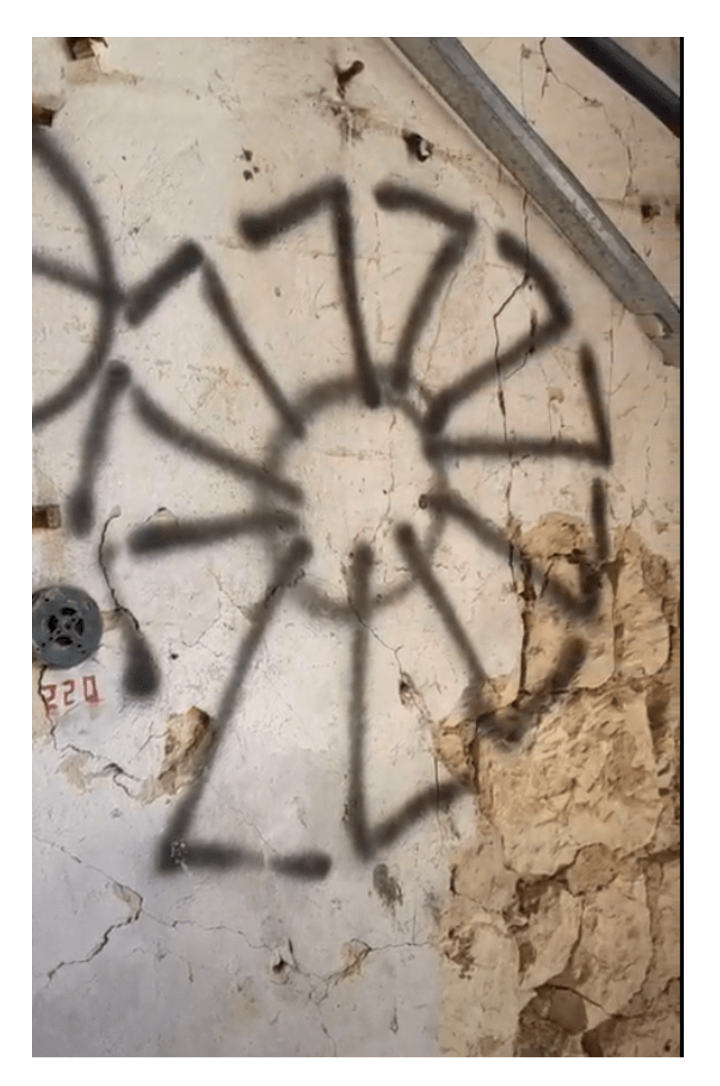
Black Sun Nazi symbol we found at building in village of Krymskoye that had been occupied by Ukrainian military.

The Italian journalist asked: "So they were not locals, these were western Ukrainians?"