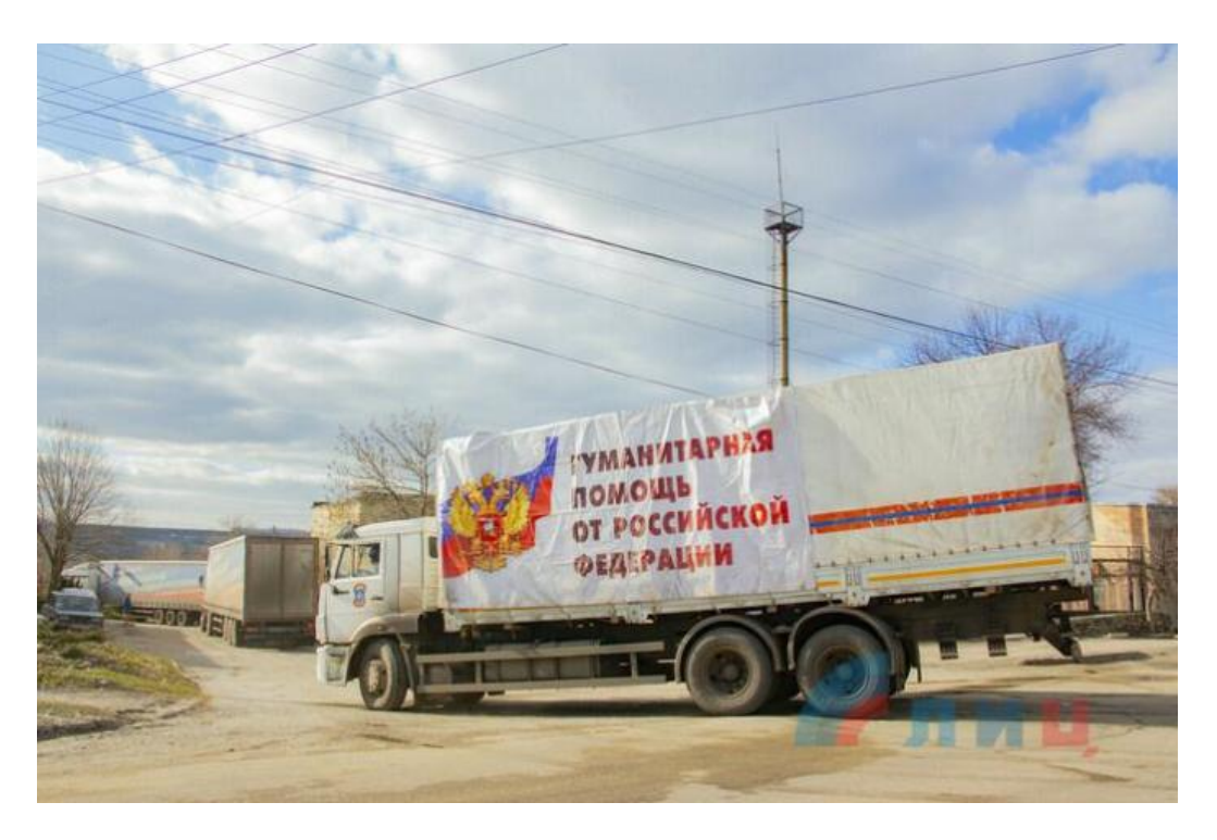
Russian humanitarian aid convoy in Lugansk.

Despite the danger and the fact that the Ukrainian military still controlled the area, the Russian and Lugansk soldiers, at great risk to their own lives, were able to get some aid to the residents of the shelter even before the area was liberated.