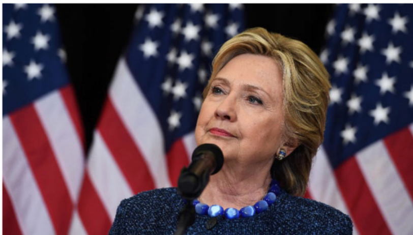
Hillary Clinton answers questions about the FBI reopening a probe into her use of a private email server on Oct. 28, 2016.