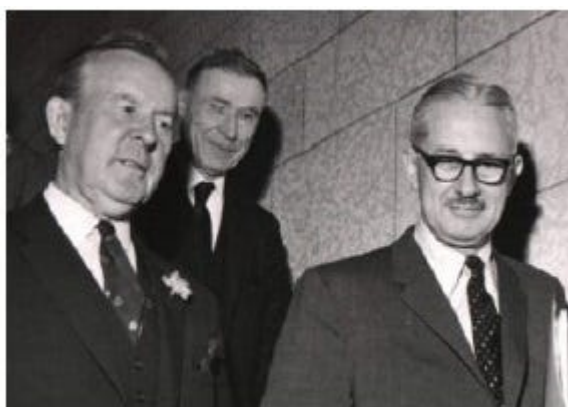
Lester Pearson and his sometimes controller Walter Gordon in 1963 entering the Commons.

During this time, Gordon was fully in control of Lester B. Pearson, having taken Pearson’s leash from Vincent Massey in the 1950s. Gordon had organized Pearson to head the Liberal Party ever since 1949, writing to Pearson in 1955 that “I have a feeling that people would like to follow your star in droves- if and when you decide the time is right to give them the nod.” (2). Before even becoming a member of the Liberal Party, Gordon even paid for a large scale Nobel Prize gala in Pearson’s honour from his own pocket in 1958 (3).