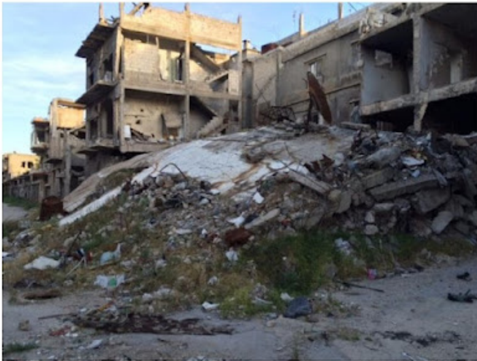
Image: Destruction in Homs