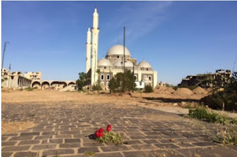
Image: Spring flowers, a symbol of hope in Homs

“This Accommodation Centre serves 5,000 IDPs who arrived on 16 March. The Government made this and other Centres available. Many NGOs are working here, together with the Ministry of Social Affairs, the Syrian Red Crescent, UNICEF and ICRC. The Syrian Army provides security and the Ministry of Education provides education. This is only a temporary stay until the people can return to homes. They are here while we check their records. If any are found to have a bad record, we discuss their details and we are working on reconciliation. Many have homes which have been destroyed. Work is being undertaken to rebuild them.”