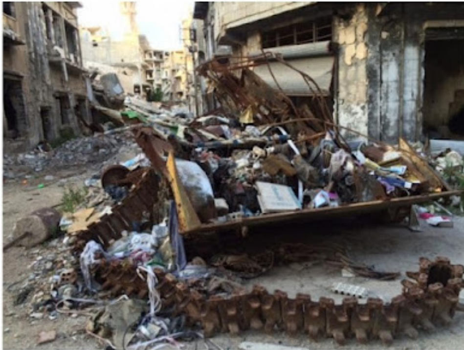
Image: Remains of a Syrian Army tank