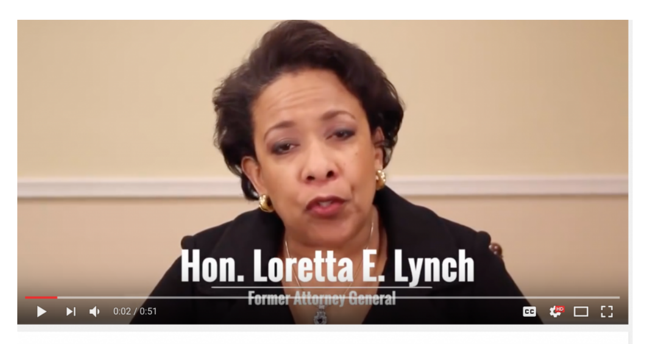
Democrats and Obama ARE SCARED! Loretta Lynch: "Need more 'marching, blood, death on streets"

Staged anarchist agitation and violence—"protest culture"—is not only being normalized, but popularized. The masses are being successfully indoctrinated. Witness the pervasiveness and viciousness of Hollywood and sports celebrities, who have not refrained from calling for violence against Trump.