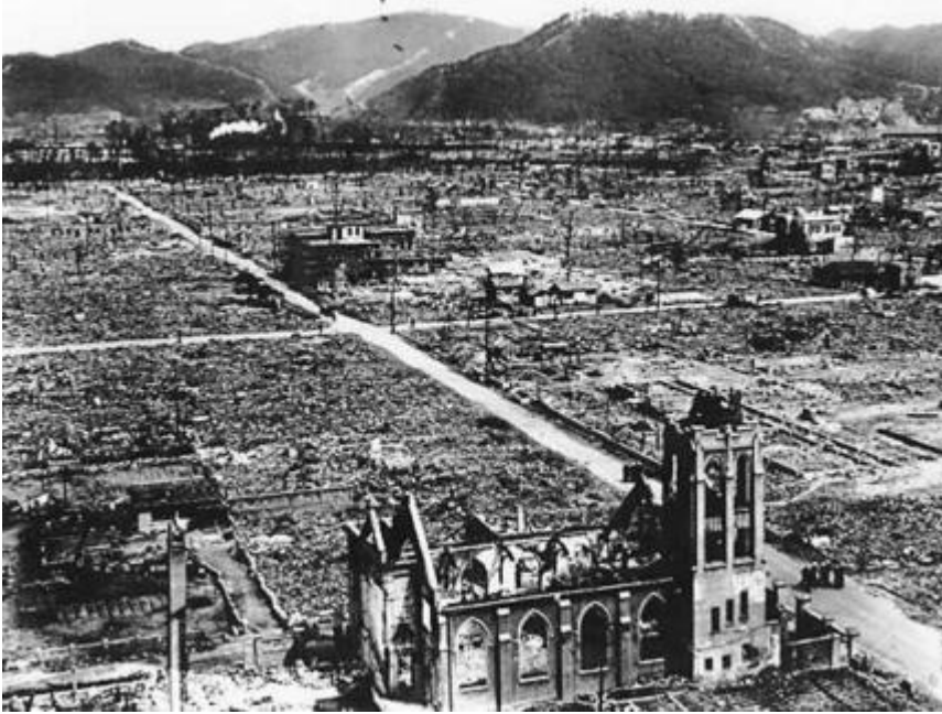
Hiroshima, August 7, 1945

Flashback to August 6, 1945, the first Atomic Bomb was dropped on Hiroshima. Up to 100,000 people were killed in the first seven seconds following the explosion.