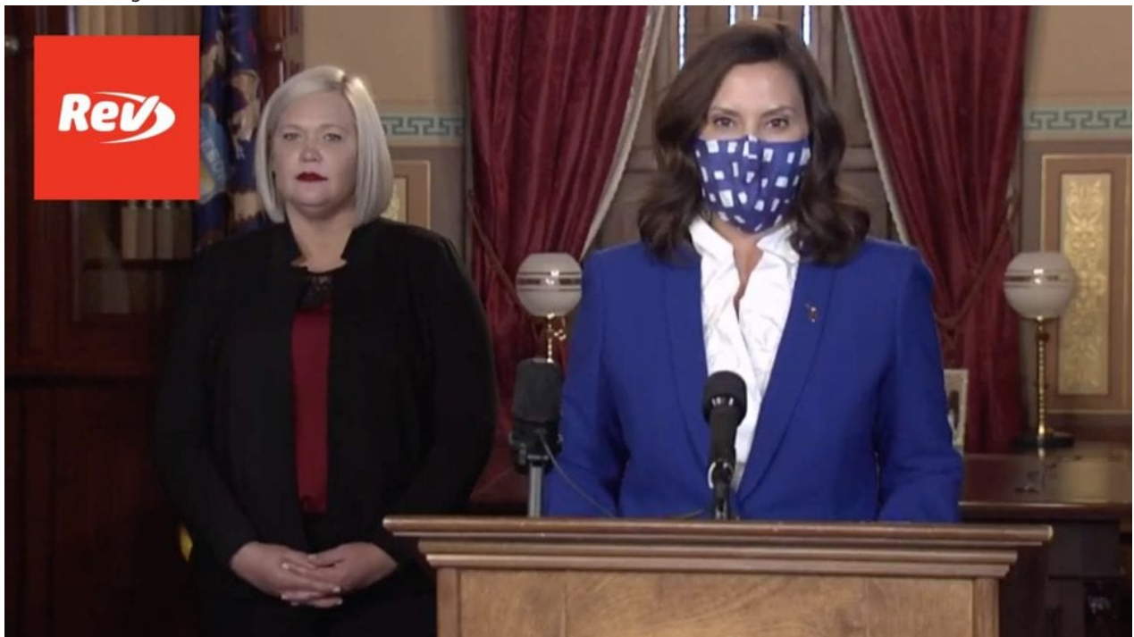
Michigan Governor Gretchen Whitmer COVID-19 Press Conference Transcript November 19