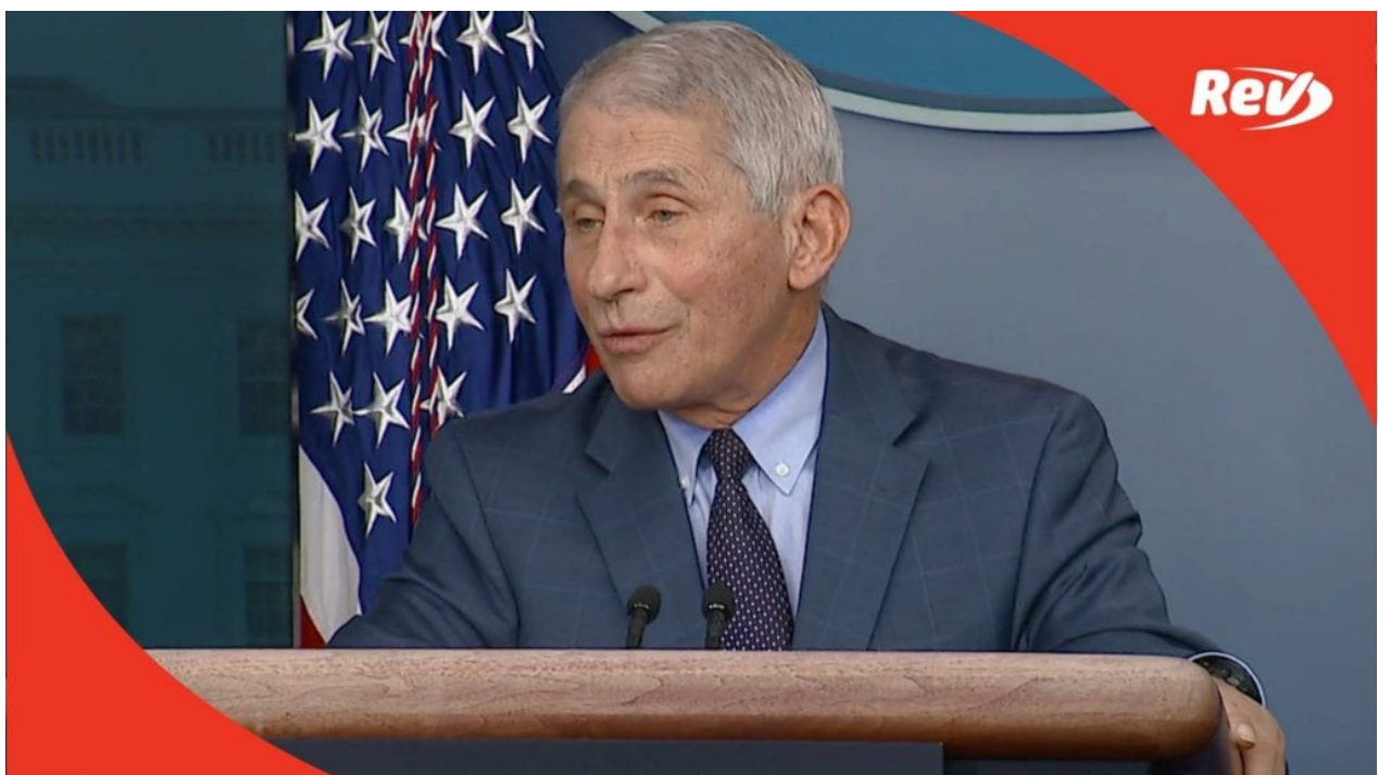
White House Coronavirus Task Force Press Conference Transcript November 19