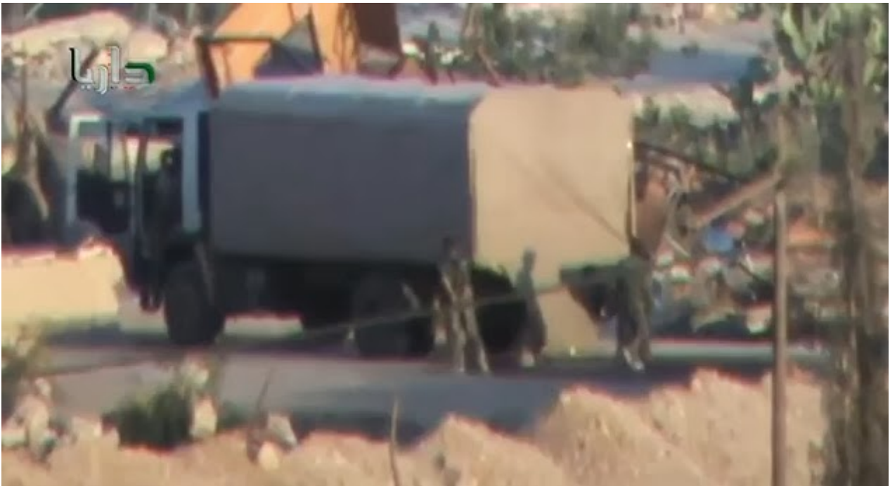
Image: After firing a single rocket, the truck is promptly covered and prepared for transit. The purpose of a national chemical arsenal is to provide a deterrence against foreign aggressors and for deployment in pitched, full-scale warfare. This modified truck was clearly designed for launching a single rocket, at a painfully slow rate of fire - not for tactical purposes. It is however, literally, the perfect vehicle for a false-flag attack, particularly the chemical attack carried out in Damascus in late August.