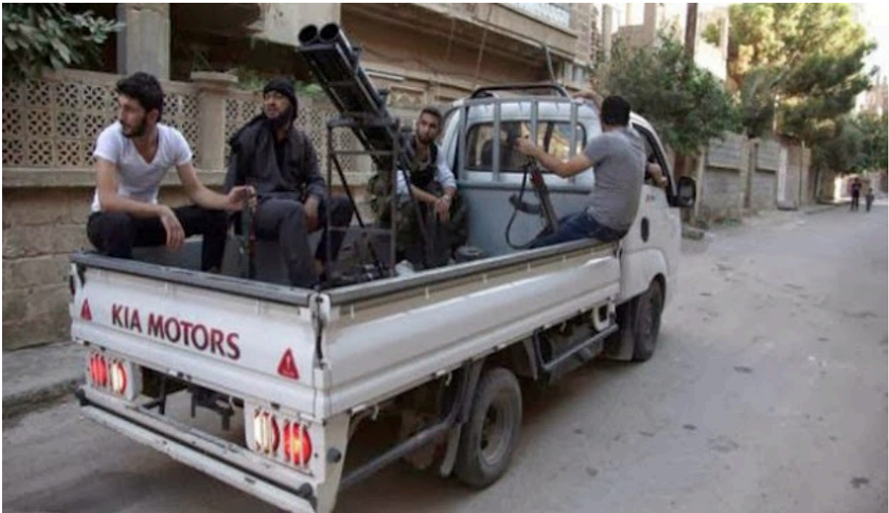
Image: Terrorists in Syria, and previously in Libya, with the exception of stolen military vehicles, rely on improvised fighting vehicles of varying sophistication called “technicals” like the one pictured above. The larger flatbed featured in a recent video, launching a rocket similar to those found at the scene of an alleged August chemical weapons attack in Damascus, is also clearly an improvised fighting vehicle.