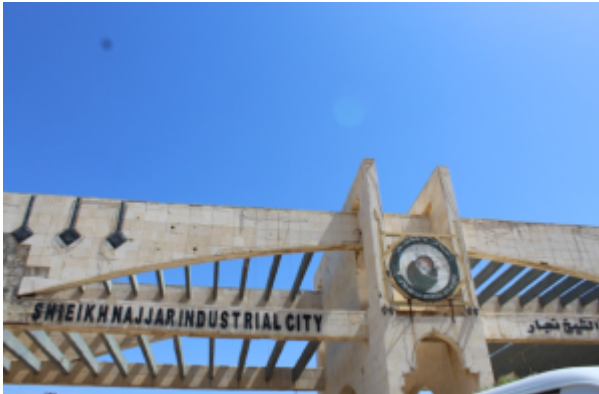
Image: Terrorist damage to Syria's industrial base, Aleppo, Syria

But I went also to Aleppo into this industrial park. Okay? It was in the [inaudible 00:19:16] of Aleppo. And I hope I don't make mistakes here, but if I do, I do. Anyway, we went to this industrial park and it was totally destroyed. And we sat down with some business people. And it was totally destroyed. And what happened was the terrorists, Western-supported terrorists, went in there and they stole... Everything that they could steal, they did steal and it ended up in Turkey, and everything else they destroyed. So the goal here is to help Empire destroy infrastructure, destroy the country, to weaken the country. And they're still doing it. Now Empire's openly stealing the oil. Trump said, yeah, I like oil. And they're openly stealing the oil. So Syria is a oil-rich country, but now with the sanctions, they have maybe one or two hours of electricity a day. Most of them, 80 or 90% are living in poverty, and they don't have enough oil resources. Why? Because it's being stolen. Why? Because Empire has imposed these unilateral, coercive measures called sanctions, they are criminal, that amount to collective punishment.