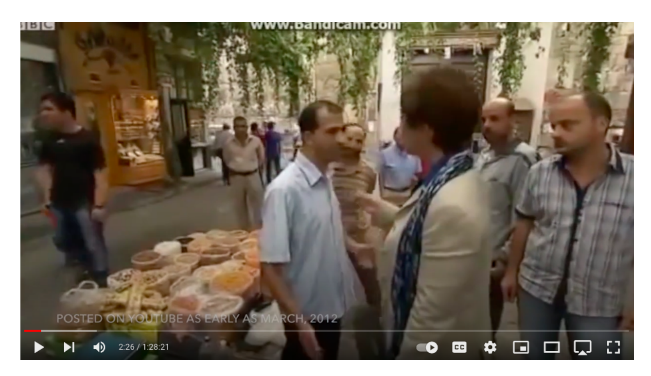
Click here to view the video