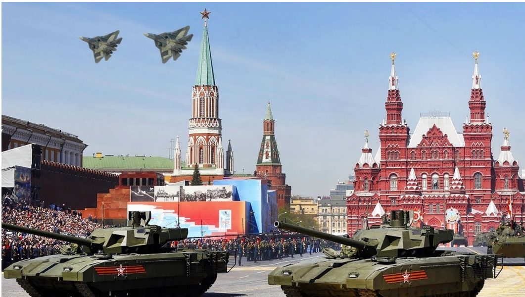
Russia's Victory Day Parade 2018

The only plausible answer that occurs to those of us investigating, is the shame of the Molotov-Ribbentrop pact between the Soviet Union and Nazi Germany. However, given the obviousness of the colonial powers heavily arming Nazi Germany under such a pathetic excuse as to make Nazi Germany only a “bulwark against communist Soviet Union,” and then refusing all entreaties of the Soviets to form an protective alliance in the face of Hitler’s ever increasing belligerence, Stalin’s surprise signing a non-aggression pact seems like a last resort defense of Russia.