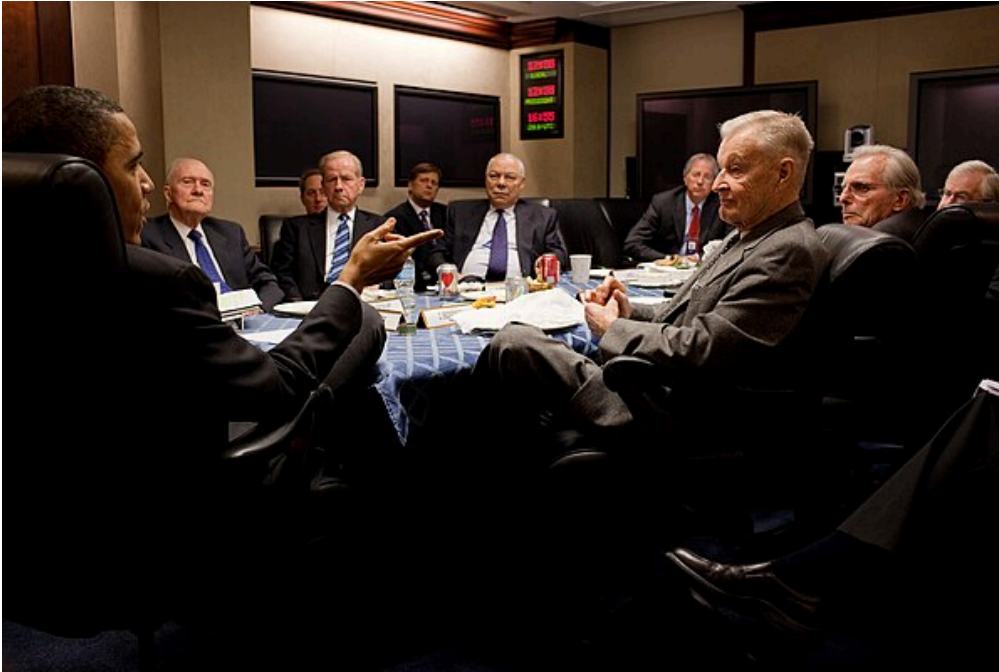
Brzezinski and fellow former National Security Advisers meet with President Obama in the Situation Room. September 1, 2010.

And the Grand Chessboard master Zbigniew Brzezinski: