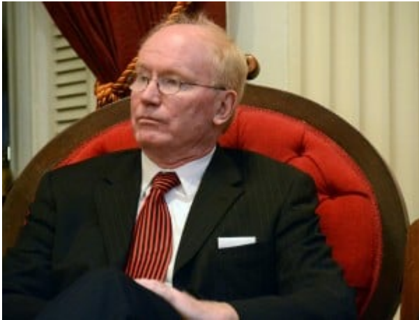
State Senator Kevin Mullin of Vermont, sponsor of vaccine legislation

their 12-month vaccination appointment and for 1 in 730 children following their 18-month vaccination appointment (see appendix for a scientific study, Item #5).