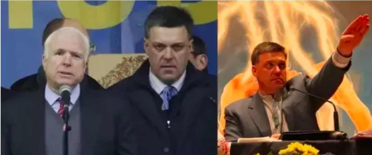
John McCain on stage in Kiev with neo-Nazi leader Oleh Tyahnybok

After the coup, the new government immediately accepted the IMF loan [37] which Yanukovych had vetoed, and began massive auctions of state assets. [38] [39] Dozens of openly neo-Nazi and ultranationalist paramilitary organizations were subsequently inducted into the Ukrainian Armed Forces with official recognition, state funding, and arms [40] [41] . The most notorious of these include Azov, Aidar, Svoboda, Right Sector, Misanthropic Division, National Corps, C14, Ethnic National Union, and Patriots of Ukraine.