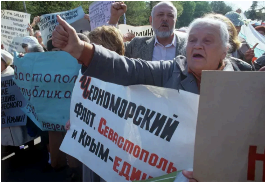
A woman with a banner saying “Black Sea Fleet, Sevastopol and Crimea are a unified whole”, 1992

In 1997, Russia and NATO signed [11] the Founding Act on Mutual Relations, Cooperation, and Security. For a brief moment, it seemed that NATO was interested in working together on a mutual security arrangement in Europe including and cooperating with Russia.