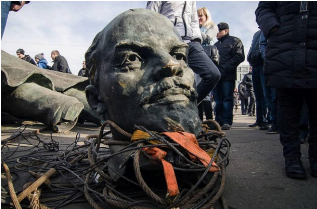
Statue of Lenin dismantled and destroyed, Odessa region, 2021

unenforced. Neo-Nazi symbols such as the Wolfsangel—used by the SS—and the Black Sun—created by SS leader Heinrich Himmler—remain the official symbols for groups such as Azov. Any positive reference to the Soviet period was made illegal, and dozens of Soviet monuments honoring the heroic sacrifices endured by the Red Army in fighting the scourge of fascism in Ukraine were vandalized, dismantled, and destroyed. [57] Street names were even renamed if they were deemed to be too Russian-sounding. [58]