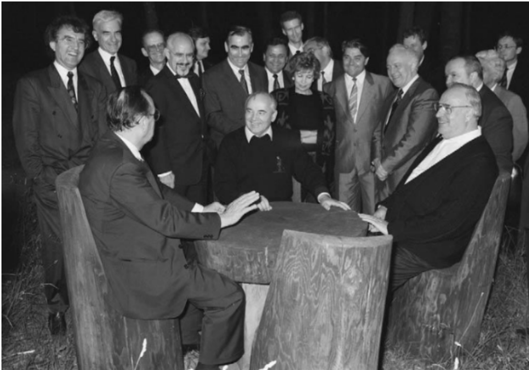
Michail Gorbachev discussing German unification with Hans-Dietrich Genscher and Helmut Kohl in Russia, July 15, 1990.

and context while claiming Russian irrationality. We must understand the historical and geopolitical context to know which forces are at play so we can chart a realistic pathway to peace.