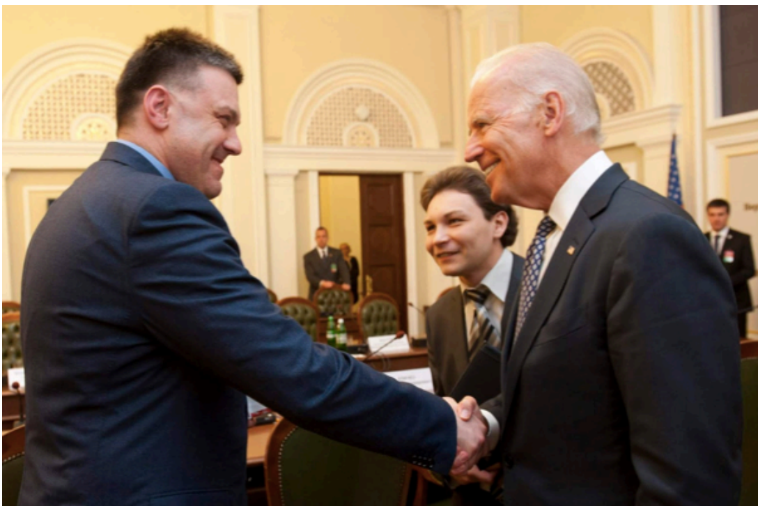
Then Vice-President Joe Biden shaking hands with Oleh Tyahnybok

As the Maidan protests in Kiev sent the President into exile, anti-Maidan protests began to escalate around the country [32] , especially in majority-Russian speaking areas [33] . In May, 40 anti-Maidan protesters—mostly ethnic Russians—were burned alive [34] in a trade union hall in Odessa by neo-Nazis. Nazis shot people as they were jumping from windows to escape the flames, and survivors were beaten to death in the streets.