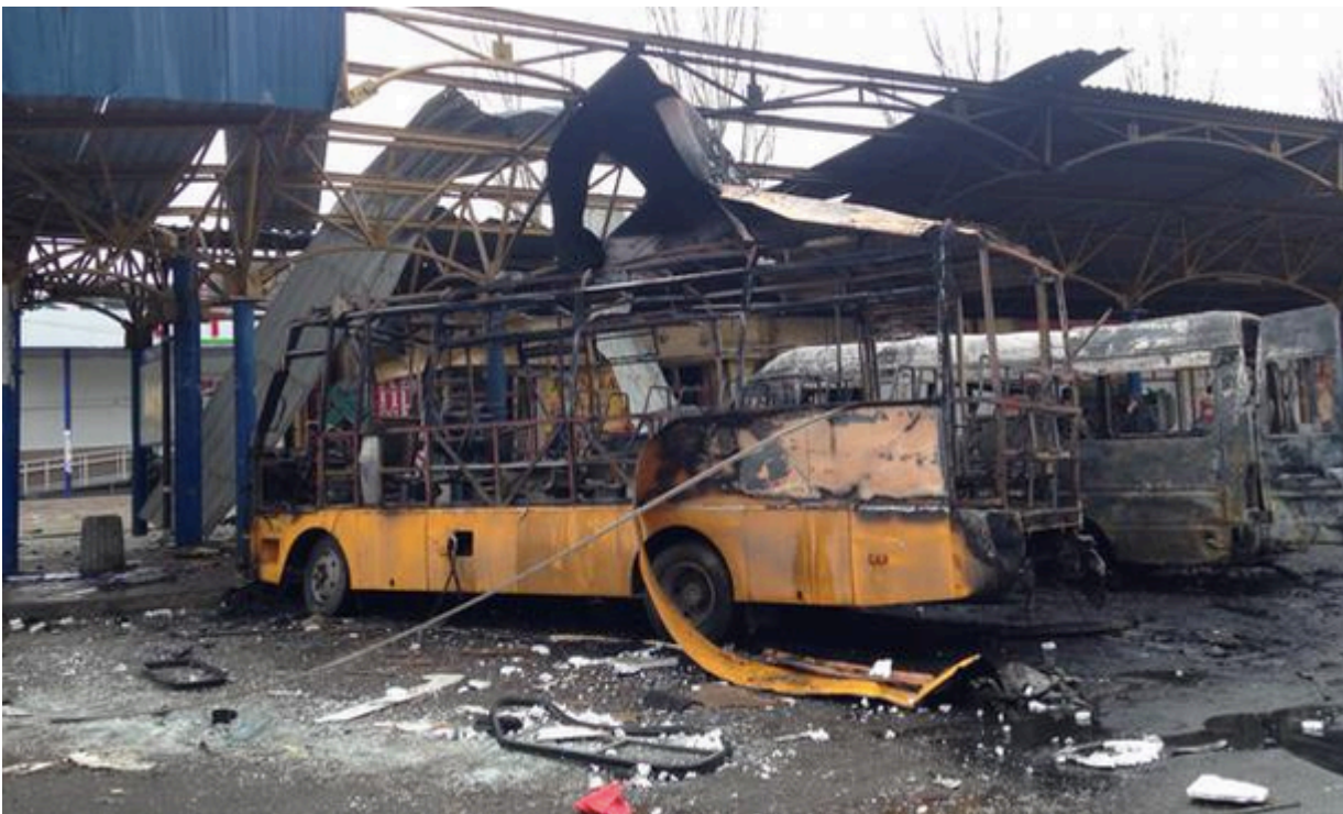
Aftermath of the shelling of the central Donetsk bus station, 2015

Over the coming months, civil unrest intensified as protests [42] [43] against the Maidan coup and the new Kiev government in the Donbass region of eastern Ukraine continued. Neo-Nazi and ultranationalist militias began shelling civilian areas of the Donbass region, which is majority Russian-speaking.