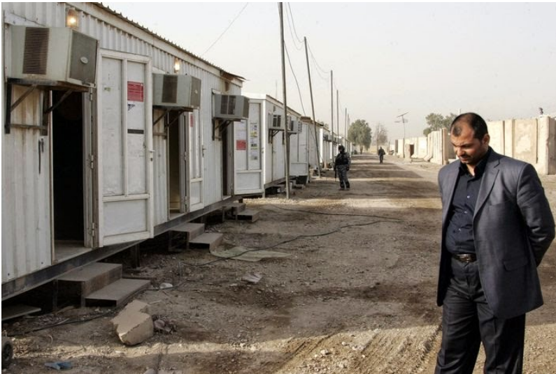
Image: MEK terrorists have been given safe haven by the US at Camp Ashraf and then former US military base, Camp Liberty.

covert funds, the Pentagon consultant told me, may well end up in M.E.K. coffers. “The new task force will work with the M.E.K. The Administration is desperate for results.” He added, “The M.E.K. has no C.P.A. auditing the books, and its leaders are thought to have been lining their pockets for years. If people only knew what the M.E.K. is getting, and how much is going to its bank accounts—and yet it is almost useless for the purposes the Administration intends.