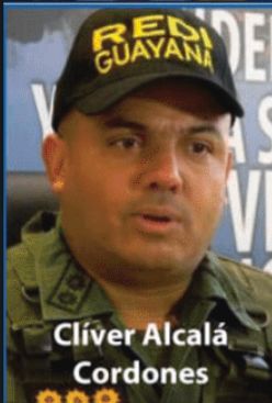
Clíver Alcalá Cordones

Recompensa de hasta $10 millones cada una por información relacionada con: