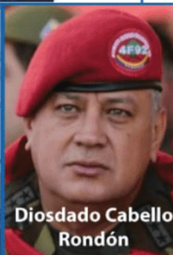
Diosdado Cabello Rondón