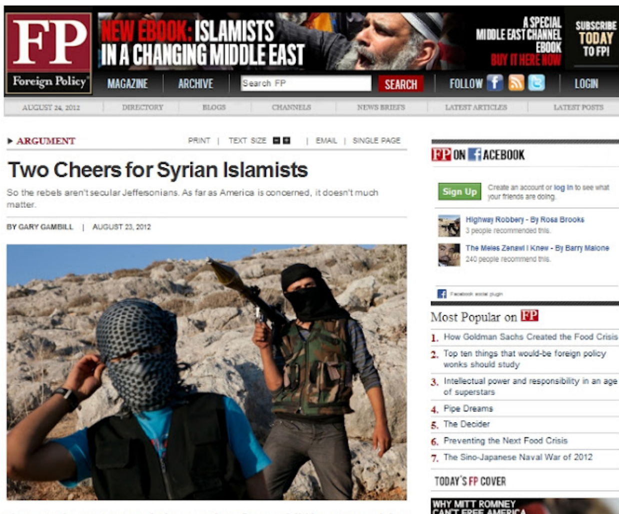
Image: The West has only thinly veiled its support for Al Qaeda and ISIS before an impressionable general public. In policy circles, talk of using Al Qaeda to divide and destroy Wall Street's enemies around the planet is lively and enthusiastic.

These zones once created, will include US armed forces on the ground, literally occupying seized Syrian territory cleared by proxies including Kurdish groups and bands of Al Qaeda fighters in the north, and foreign terrorist militias operating along the Jordanian-Syrian border in the south. Brookings even admits that many of these zones would be created by extremists, but that “ ideological purity ” would “ no longer be quite as high of a bar. ”