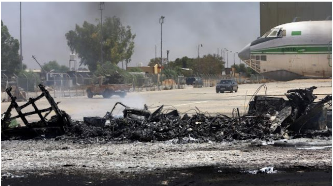
Image: US-NATO “liberated” Libya is dominated by Al Qaeda who has more recently rebranded itself as ISIS. Claims by US policymakers that its incremental invasion of Syria will result in anything differently for Syrians is dishonest at best.

This strategy can almost certainly be used to finally destroy Syria. It cannot however, be used to do any of the things the US will promise in order to get the various players necessary for it to succeed, to cooperate.