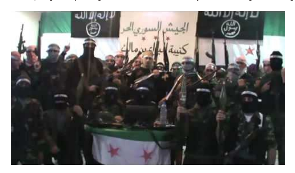
Image: As more photos depicting Syria's so-called "Free Syrian Army" as fighting under the banner of Al Qaeda emerge, hiding Al Qaeda's presence becomes more difficult for the Western press and the corporate-financier interests they represent. Therefore a simultaneous campaign is being waged to spin Al Qaeda's presence as "recent" and "unexpected," while attempts are made to repackage the militant group as "heroes."

While AP attempts to claim this is a disturbing trend that "US officials" are worried about, other representatives of the corporate-financier interests driving Western foreign policy are attempting to repackage Al Qaeda as "necessary" and shifting to a benign ally.