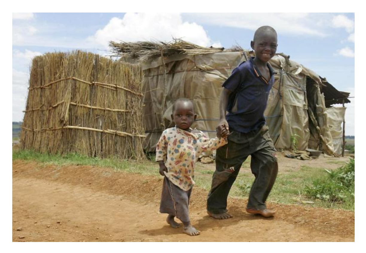
Zimbabwean kids living in abject poverty.

Many people also died in road accidents because the government could no longer fund first responders, while Zimbabwe's rail infrastructure became dilapidated as it had been dependent on General Electric (GE) for the furnishing of locomotives.