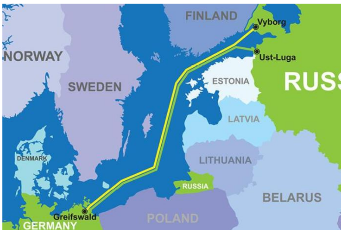
Route of Nordstream 2 Pipeline.

Among the “severe consequences” threatened by the U.S. against Russia, the Financial Times has said sanctioning Russia’s Nord Stream 2 gas pipeline to Germany was “top of the list.” Western Europe is already facing an energy crunch, with skyrocketing prices for natural gas.