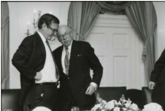
Then-Vice President George H.W. Bush with CIA Director William Casey at the White House on Feb. 11, 1981.

The U.S. intelligence community's handling of the Russian "hack" story also must be viewed in the historical context of the CIA's "politicization" over the past several decades.