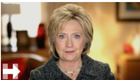
Former Secretary of State Hillary Clinton.

For instance, while it is true that many Russian officials, including President Putin, considered Clinton to be a threat to worsen the already frayed relationship between the two nuclear superpowers, the report ignores the downside for Russia trying to interfere with the U.S. election campaign and then failing to stop Clinton, which looked like the most likely outcome until Election Night.