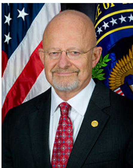
James Clapper, Director of National Intelligence.

Though it's impossible for an average U.S. citizen to know precisely what the U.S. intelligence community may have in its secret files, some former NSA officials who are familiar with the agency's eavesdropping capabilities say Washington's lack of certainty suggests that the NSA does not possess such evidence.