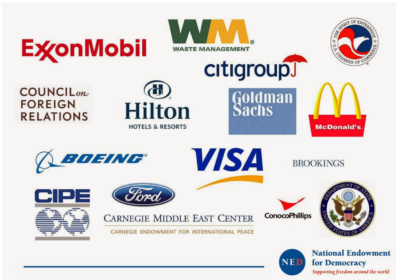
Image: The National Endowment for Democracy and its various subsidiaries including the National Democratic Institute, are backed by immense corporate-financier interests who merely couch their hegemonic agenda behind “promoting democracy” and “freedom” worldwide. Above is a representation of the interests present upon NED’s board of directors.

If democracy is characterized by self-rule, than an “Occupy Central” movement in which every prominent figure is the benefactor of and beholden to foreign cash, support, and a foreign-driven agenda, has nothing at all to do with democracy. It does have, however, everything to do with abusing democracy to undermine Beijing’s control over Hong Kong, and open the door to candidates that clearly serve foreign interests, not those of China, or even the people of Hong Kong.