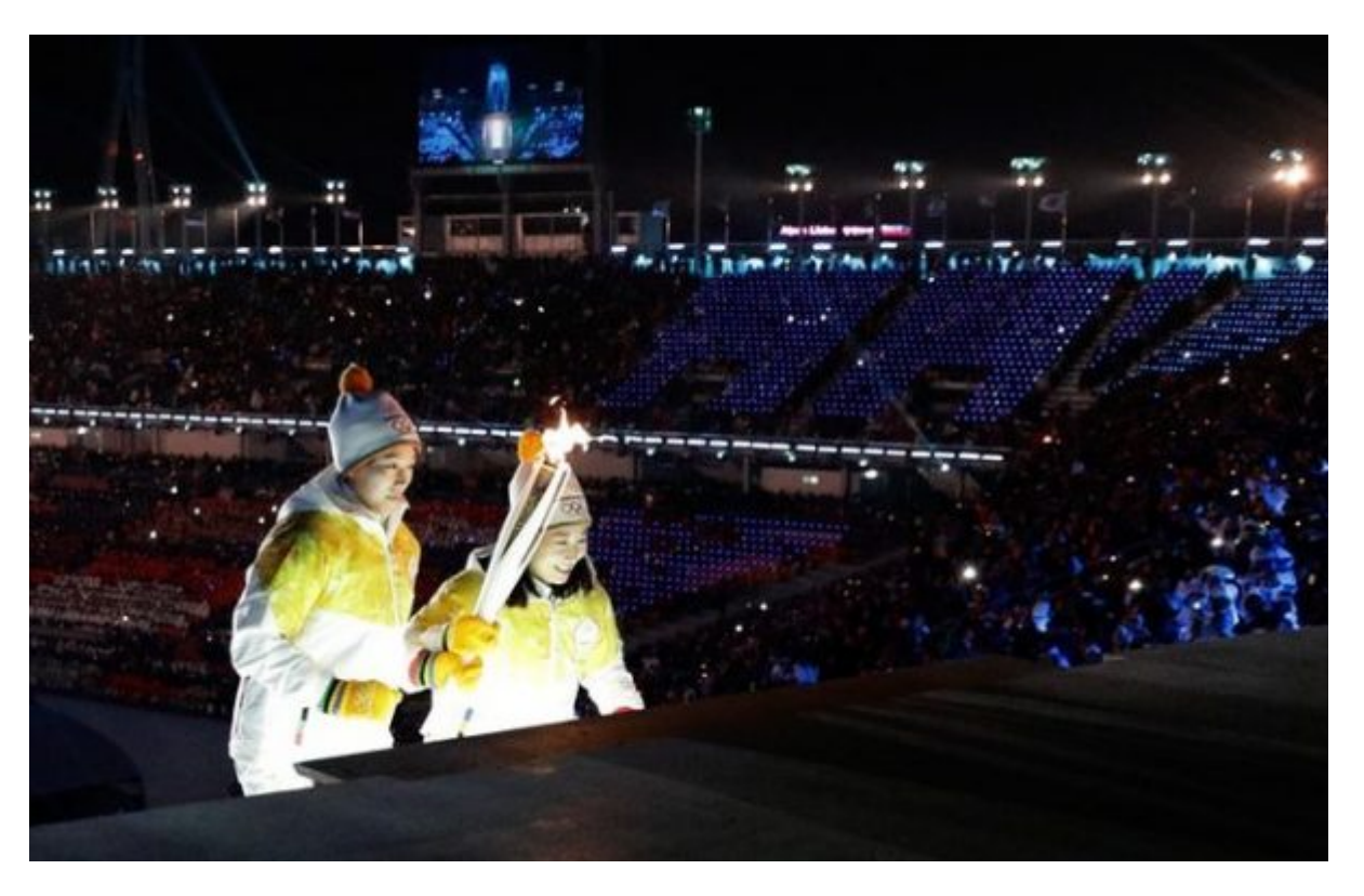
A historic moment of unity, two women who play on the unified Korean ice hockey team carried the

Another show of unity occurred when two members of the Unified Korean Hockey Team, one from the North and one from the South, carried the Olympic torch up the final flight of stairs in the opening ceremonies. They handed the torch over to figure skater Yuna Kim, a South Korean who won the gold medal in 2010 and the silver medal in 2014 who then lit the Olympic cauldron.