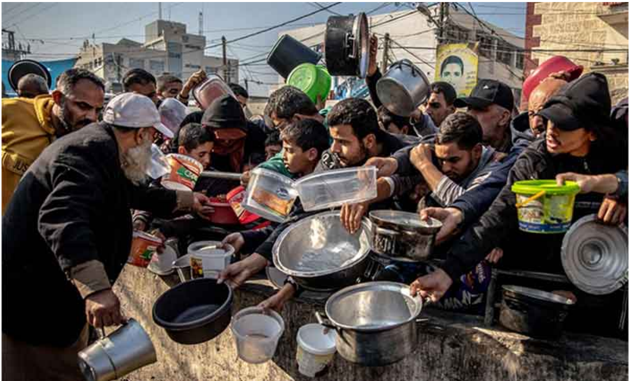
Famine in Gaza, 2023-2024

History is replete with the latter type, where the fear of not being immortal leads to the extermination of others, as if to say: “See, we are number one.” You die but we live. This is the case with the present Israeli policy of genocide of the Palestinians through famine, bombs, and guns.