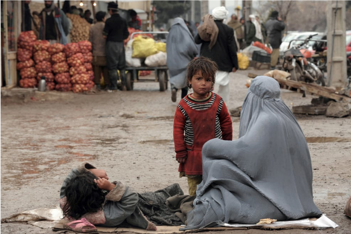
Famine in Afghanistan in the Wake of the US-NATO's "Just War" (2001)

The chosen enemy is always considered dirt, pigs, reduced to animal status not worthy to exist, and in a transference of existential trepidation emanating from a deep sense of insecurity masked as triumphalism, must be eliminated because their very existence threatens the oppressors God-like sense of themselves.