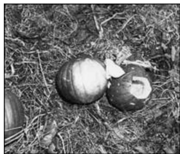
lmage: The Hollowed-Out Pumpkin at Whittaker

This account fails to mention that, as a conservative website now concedes, the pumpkin was one Chambers "had hollowed out the night before " – i.e. the night of Nixon's visit.<sup>55</sup>