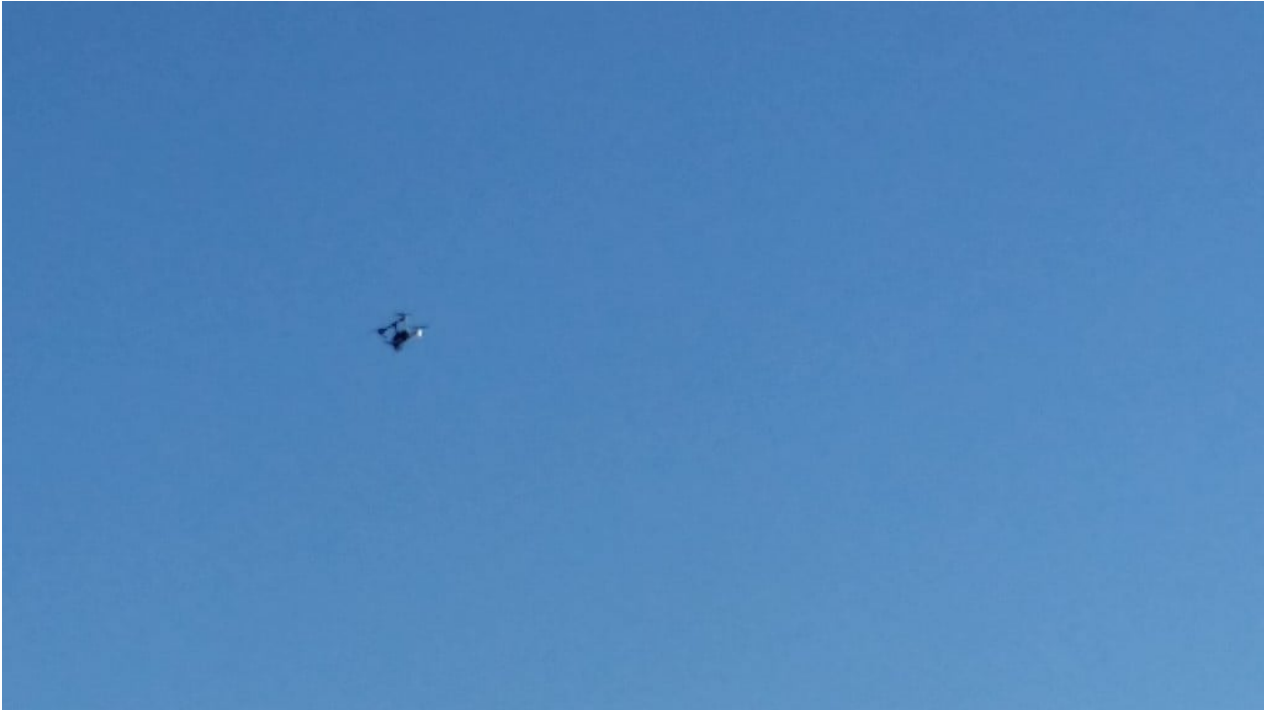
Drone watches from above.