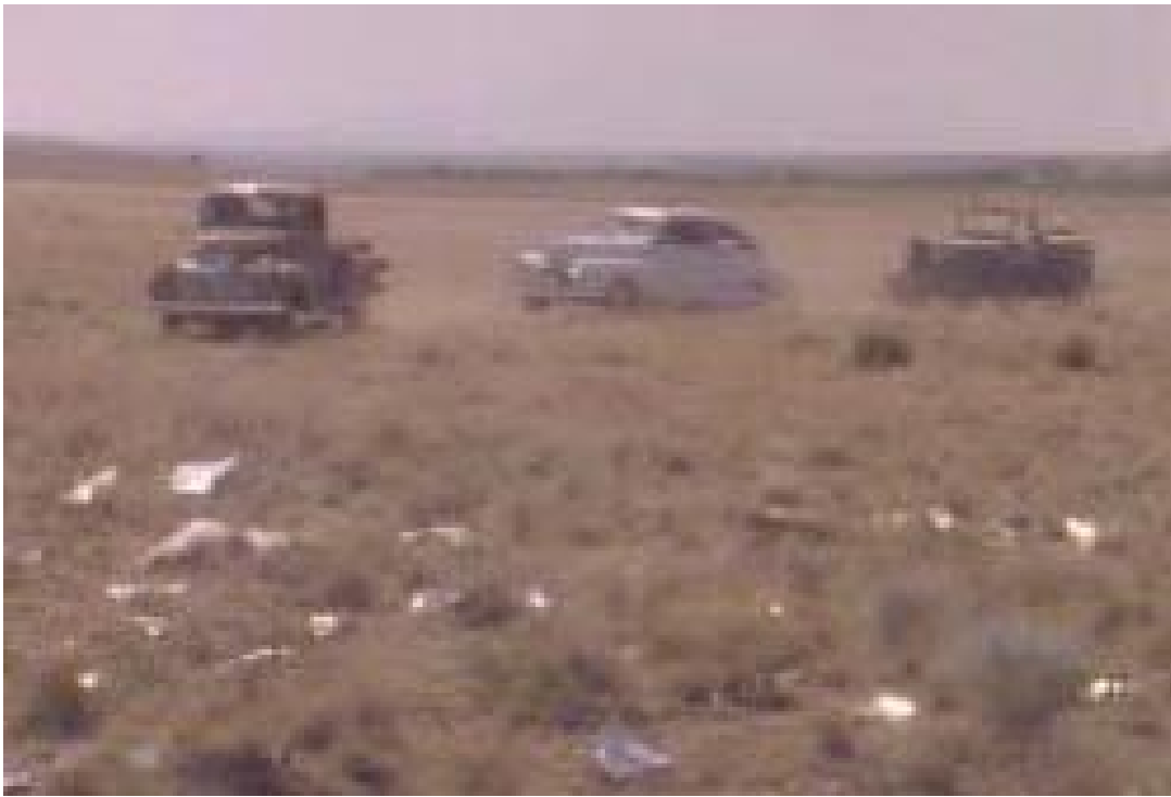
Debris in field after Roswell crash.