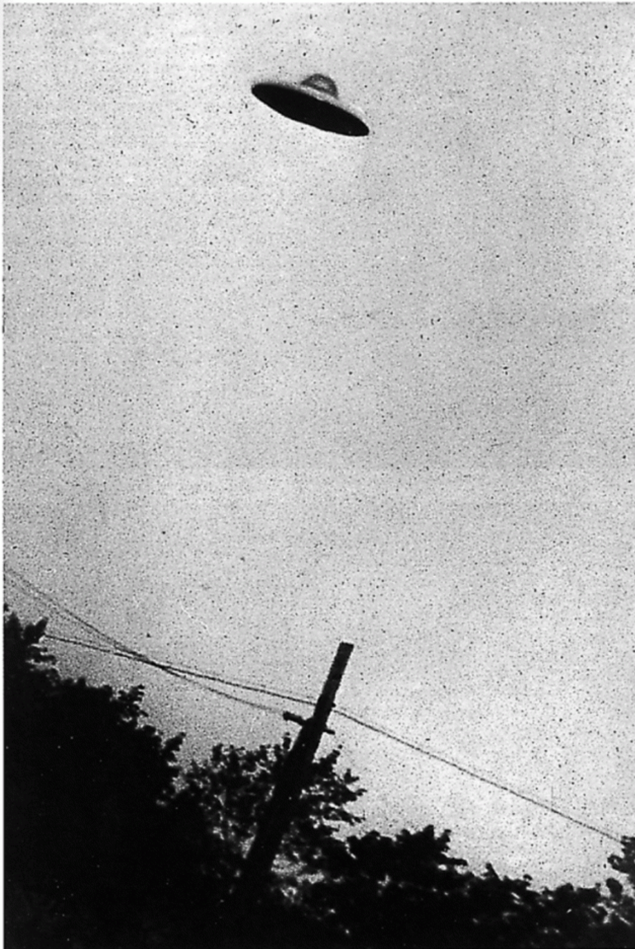
Passoria, New Jersey, 31 July 1952

Amateur photo of flying saucer in 1952.