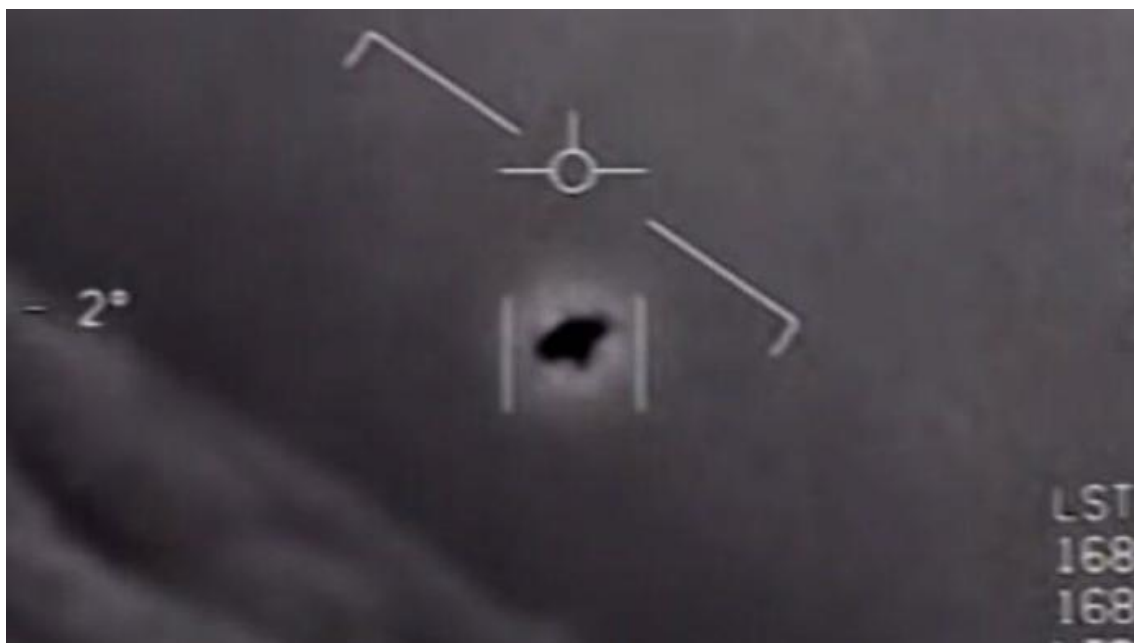
An unidentified flying object captured by the U.S. Navy in video.

Bray further said that, while some of the sightings could have been of airborne clutter, meteorological phenomenon, or U.S. industry or military technologies, of the 144 reports of UAPs documented between 2004 and 2021, 18 appeared to exhibit unspecified flight characteristics and lacked evidence of propulsion—even when they moved at excessive speeds—which made them intriguing.