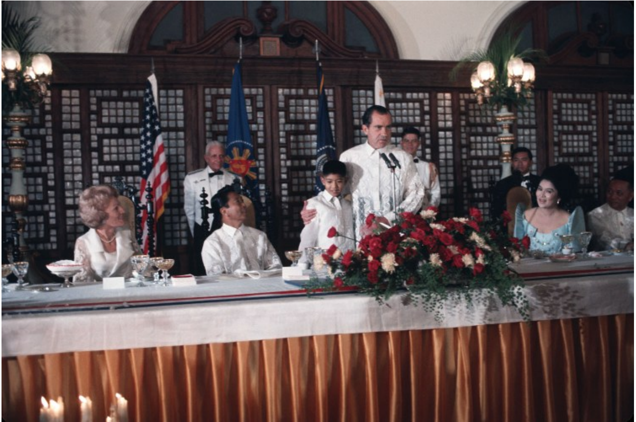
Marcos and Nixon