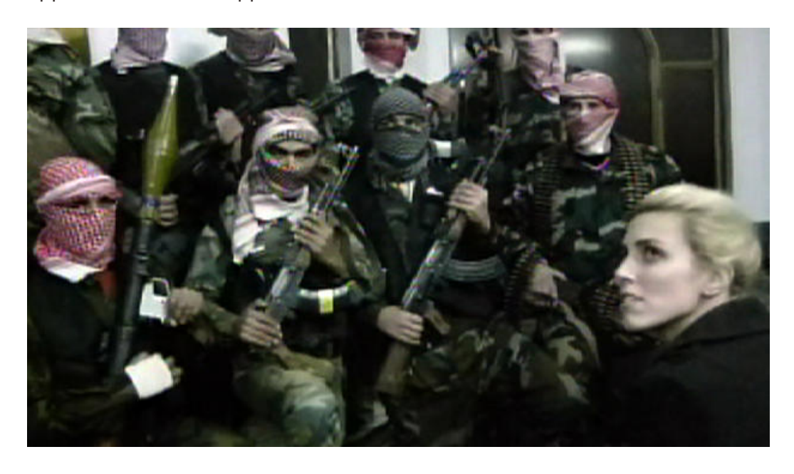
CNN's Clarissa Ward, then of CBS, with the FSA in 2011

CNN's Clarissa Ward was an especially enthusiastic promoter of the FSA, <u>embedding</u> with its fighters, painting them as a heroic resistance. When she returned to Syria years later, <u>she used</u> a <u>top mouthpiece</u> of Syria's local Al Qaeda affiliate as a fixer for her unequivocally proopposition "Inside Aleppo" series.