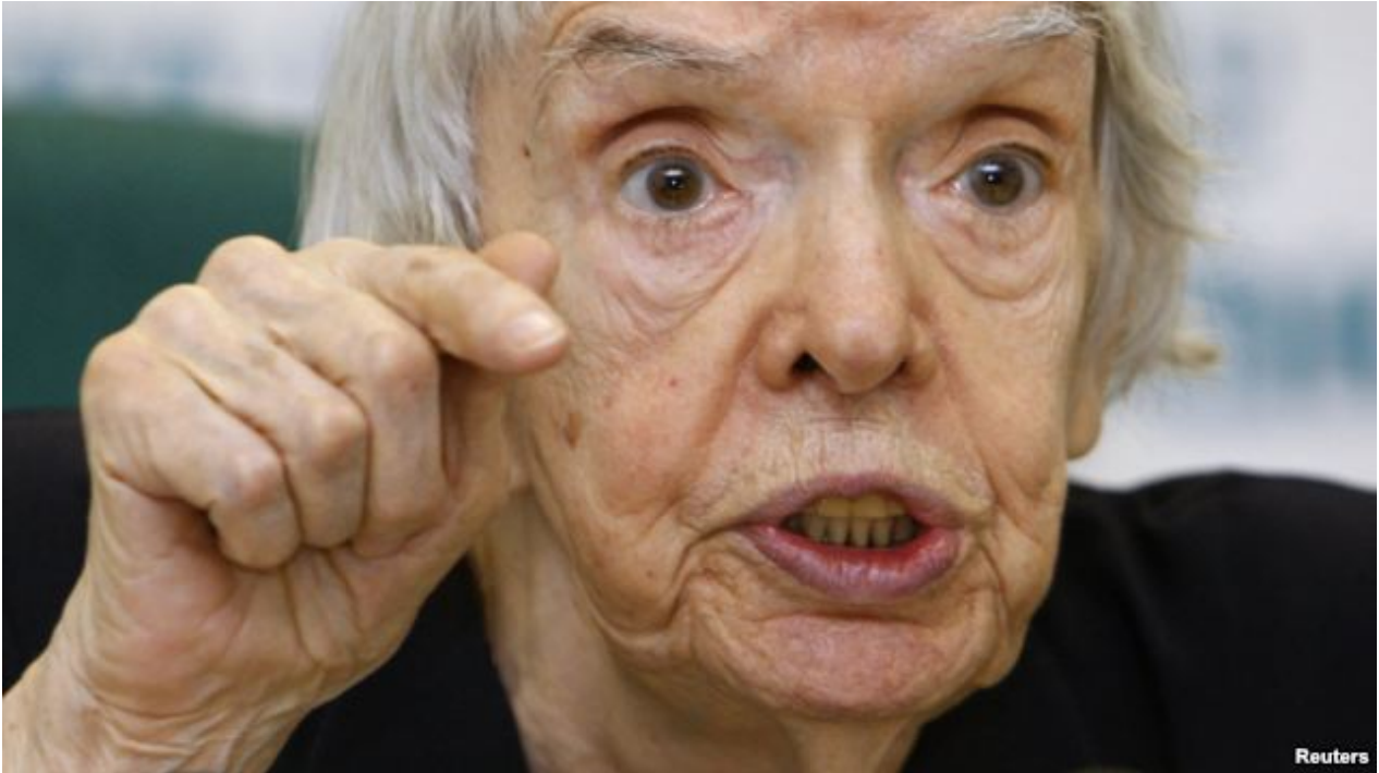
Image: Lyudmila Alekseyeva of the US State Department, Open Society Institute, USAID, NED-funded Moscow Helsinki Group claims, “this law has a despicable goal, which is to make it possible to say on television, ‘Look, they are admitting themselves that they are agents of foreign governments,’” leaving one to wonder, what should a foreign agent be called, if not a foreign agent?