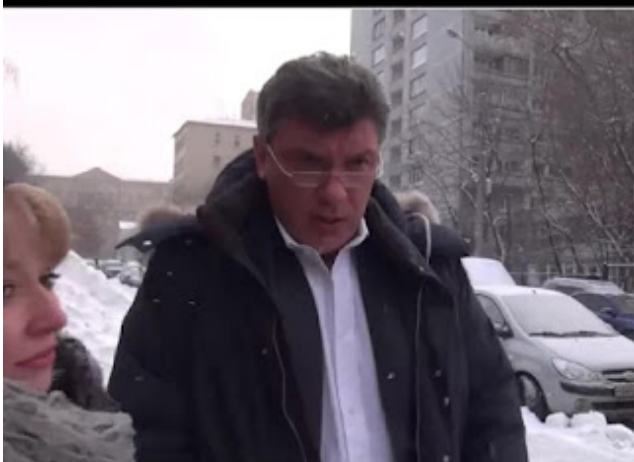
Boris Nemtsov - political opposition leader