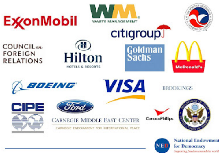
Image: A visual representation of the National Endowment for Democracy's corporate-financier ties found across their Board of Directors. Far from "human rights advocates," they are instead simply leveraging such issues to disguise what is in reality corporate-financier global hegemonic expansion.

The LA Times in fact, illustrates in their own article just how absolutely necessary this new legislation is. After claiming "the bills passed by Russia's State Duma are seen as the latest attempt to crack down on resistance to the rule of President Vladimir Putin," the Times goes on to cite the "Moscow Helsinki Group" (MHG) and their objection to the bill, never mentioning that it is in fact a direct recipient of US State Department money via the National Endowment for Democracy (NED) – and instead, merely states it receives "grants from abroad." In turn, the NED fails to properly inform the public of the corporate-financier interests, not human rights or "democratic" interests, represented throughout its Board of Directors.